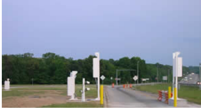
Figure 2. ISSES Equipment at Laurel NB

The ISSES technology that has proven most beneficial for enforcement is the thermal imaging camera. The radiation detection equipment performed well, but the vast majority of radiation alarms sounded for legitimate shipments of radioactive material. Over time, these radiation alarms became more of a nuisance than a help. The LPR and USDOTR reader technologies also functioned well, but there were significant performance issues with the overall system integration and user interface software for ISSES. As a result, the LPR and USDOTR technologies were never connected with a database to enable real-time screening for enforcement purposes. The thermal camera, however, showed potential for identifying inoperable brakes and flat tires. The technology helped remove the guesswork from selecting vehicles for inspection by providing visual evidence of a potential safety issue.