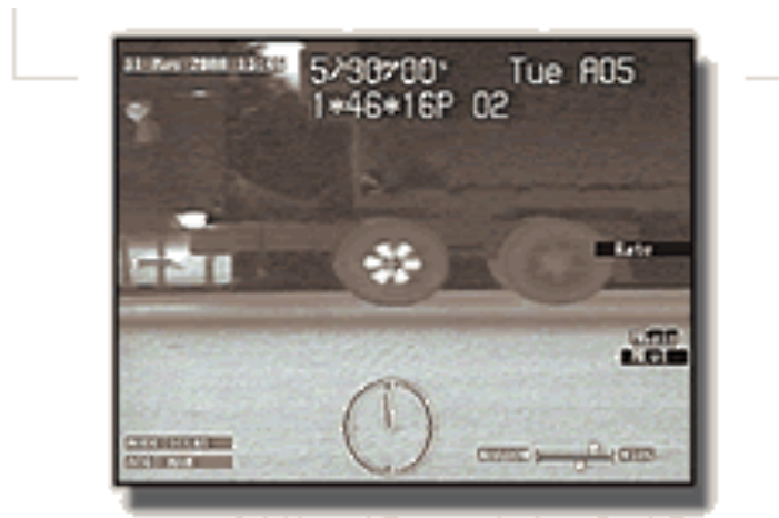
Figure 1. Thermal Imaging Displaying an Inoperable Brake

Of these technologies, only the thermal imaging camera provides information on possible real-time safety problems with the vehicle. This system can identify low or flat tires and can reveal a cold brake, which indicates it is not functioning properly. If no detectable heat emanates from the braking system, it suggests a failure, while a flat or low tire will generate a different thermal signature compared to a properly inflated tire. Figure 1 displays an image taken from a thermal camera, showing two axles from a commercial vehicle. On one axle, bright white shines through the wheel's hub, while the other hub is dark. The dark axle indicates an absence of heat, very likely due to a non-functioning brake.