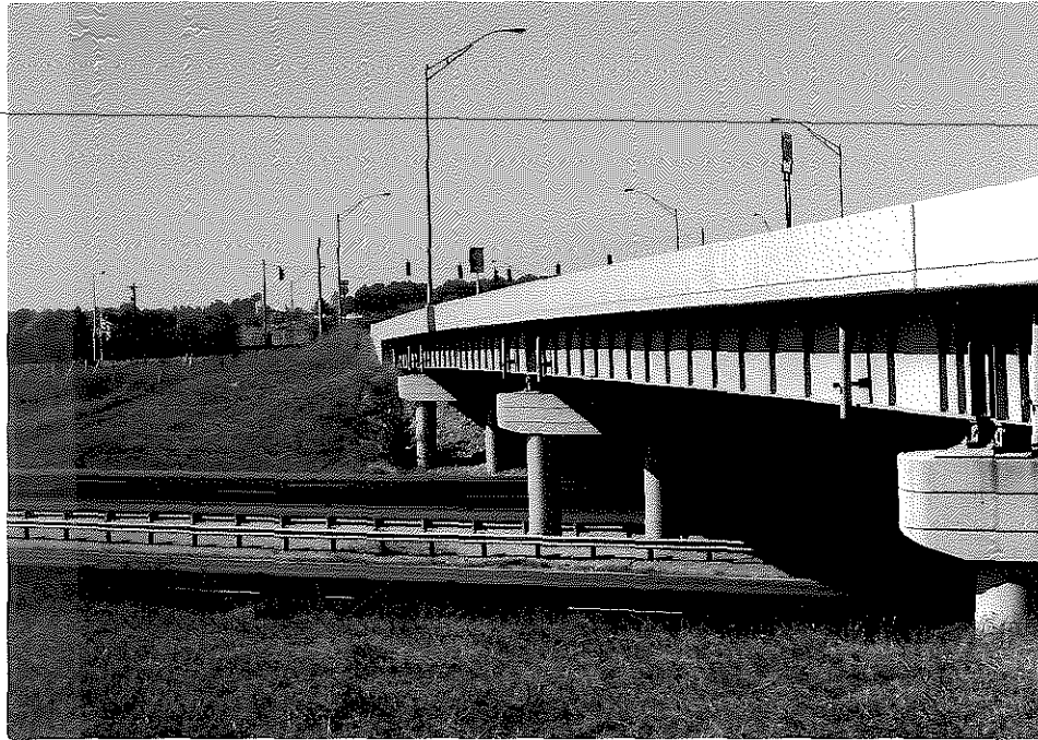
Figure 1. New Painted Girder Bridge, US 62 over I 65 in Hardin County (August 1987).