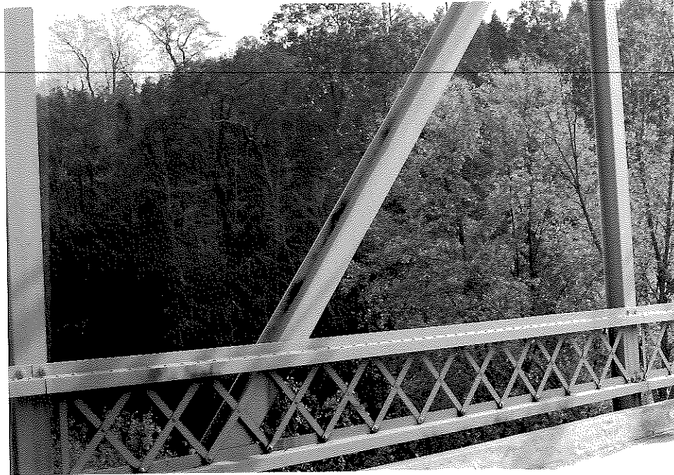
Figure 3. Diagonal and Guardrail on KY 89 over Red River (August 1987).