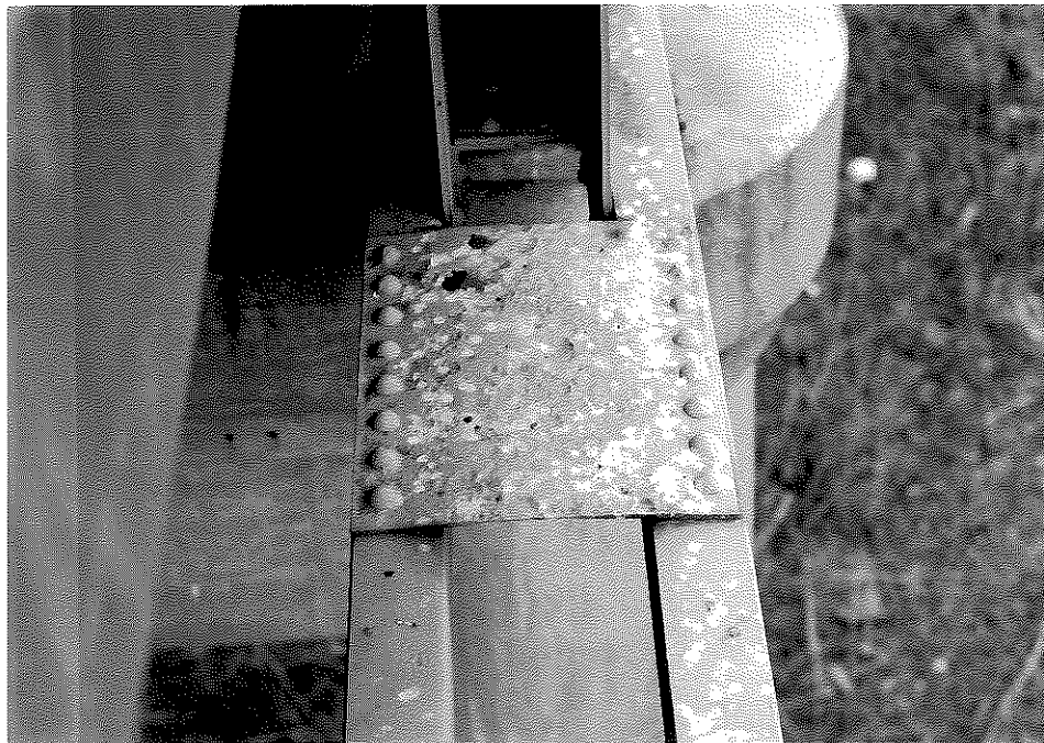
Figure 4. Batten Plate on Lower Chord Showing Previous Corrosion Damage, KY 32 over L&N RR (October 1987).