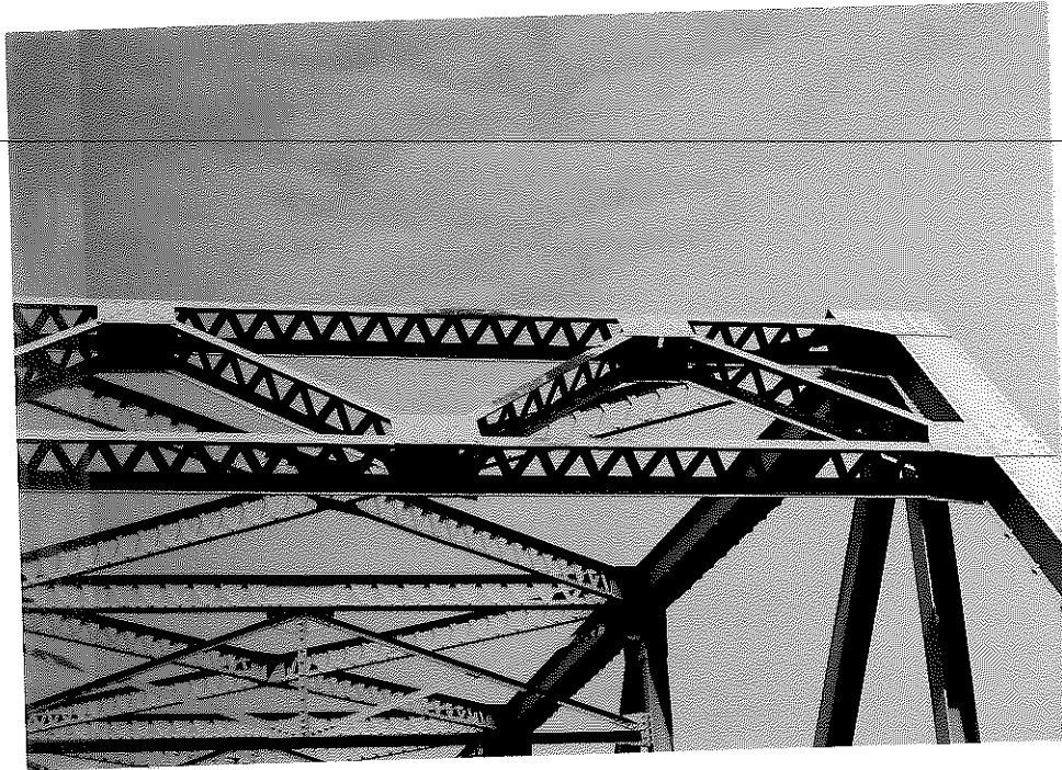
Figure 5. Rust Visible on Portal of Truss Bridge, KY 7 over Little Sandy River (November 1987).