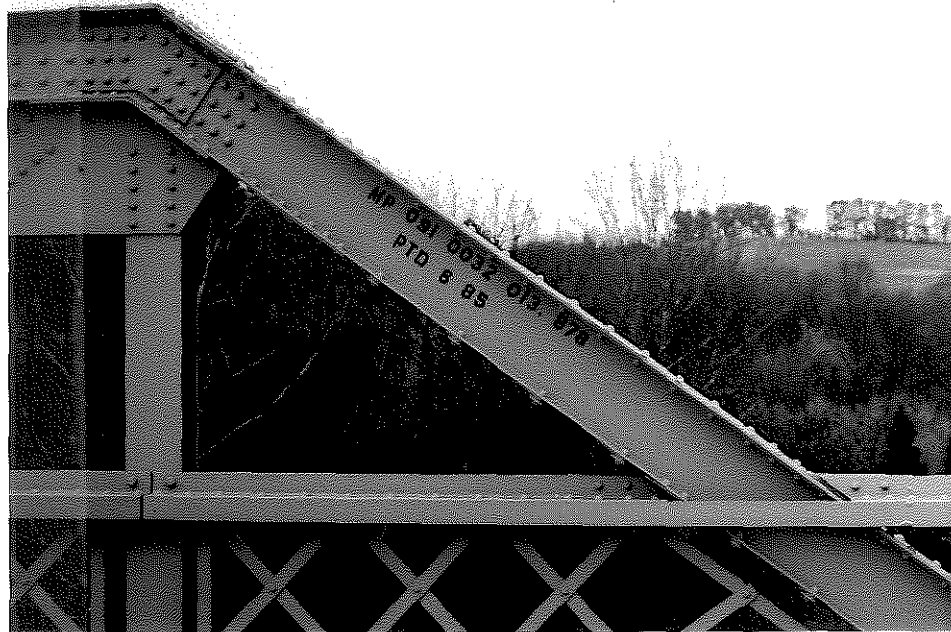
Figure 2. Guardrail and End Post of Truss Bridge, KY 32 over L & N RR (October 1987).