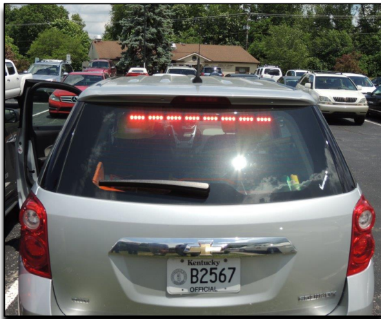
Figure B: Vehicle #1 (Rear), Red Flashing