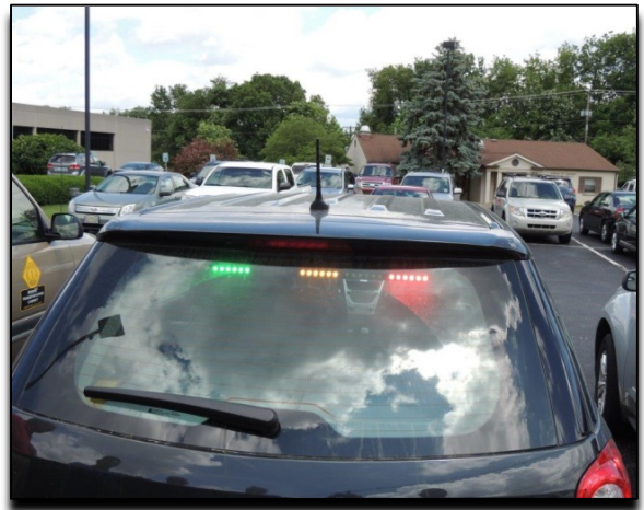
Figure D: Vehicle #2 (Rear), Green/Amber/Red Flashing