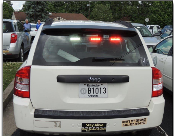
Figure F: Vehicle #3 (Rear), White/Red Flashing