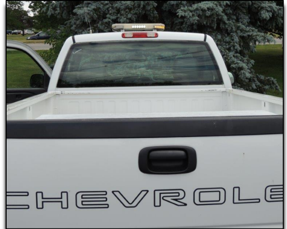
Figure J: Vehicle #5 (Rear), White/Amber Flashing