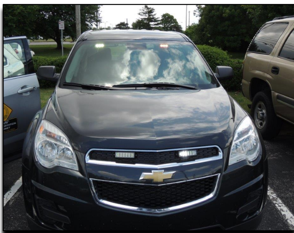
Figure C: Vehicle #2 (Front), White/Amber Flashing