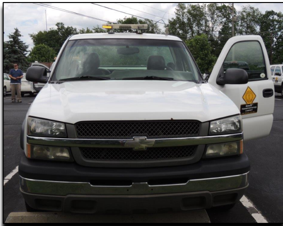
Figure I: Vehicle #5 (Front), White/Amber Flashing