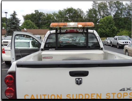
Figure H: Vehicle #4 (Rear), White/Amber Rotating