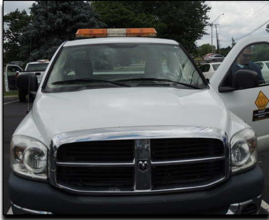
Figure G: Vehicle #4 (Front), White/Amber Rotating