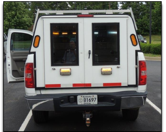
Figure L: Vehicle #6 (Rear), White/Amber Flashing