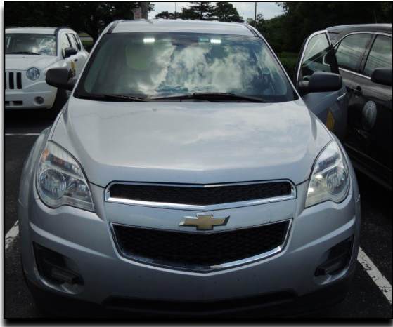
Figure A: Vehicle #1 (Front), White Flashing