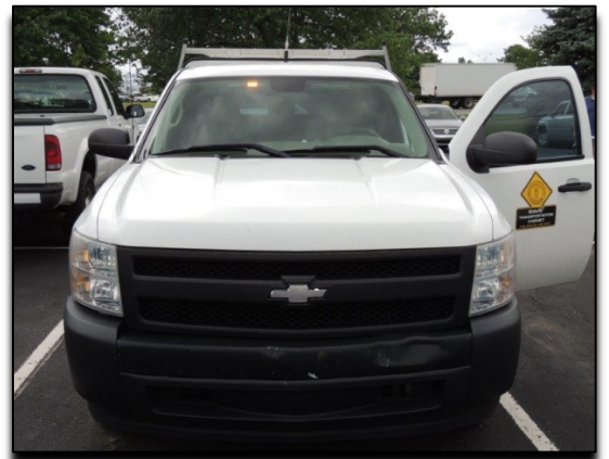
Figure K: Vehicle #6 (Front), White/Amber Flashing