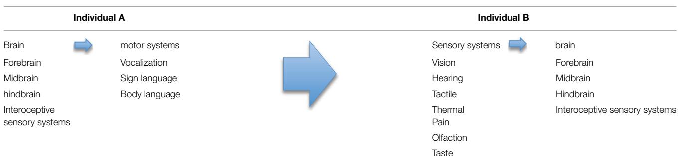
TABLE 1 | Mind-to-Mind Transfer of Information.

This simplified schematic diagrams the involvement of the body through interoceptive sensory neurons mapping the internal milieu providing moment-to-moment information to the brain for the mind's representation of "self" (Damasio, 2003). Consciously and non-consciously, the mind of one individual transmits information via vocalizations and body movements. In higher order communications, the body movements compose and use symbols (art, writing, etc.) to transmit ideas. Exteroceptive sensory neurons in another individual receive the information and carry it to the brain where its interpretation is partially dependent upon the individual's memories and sense of self.