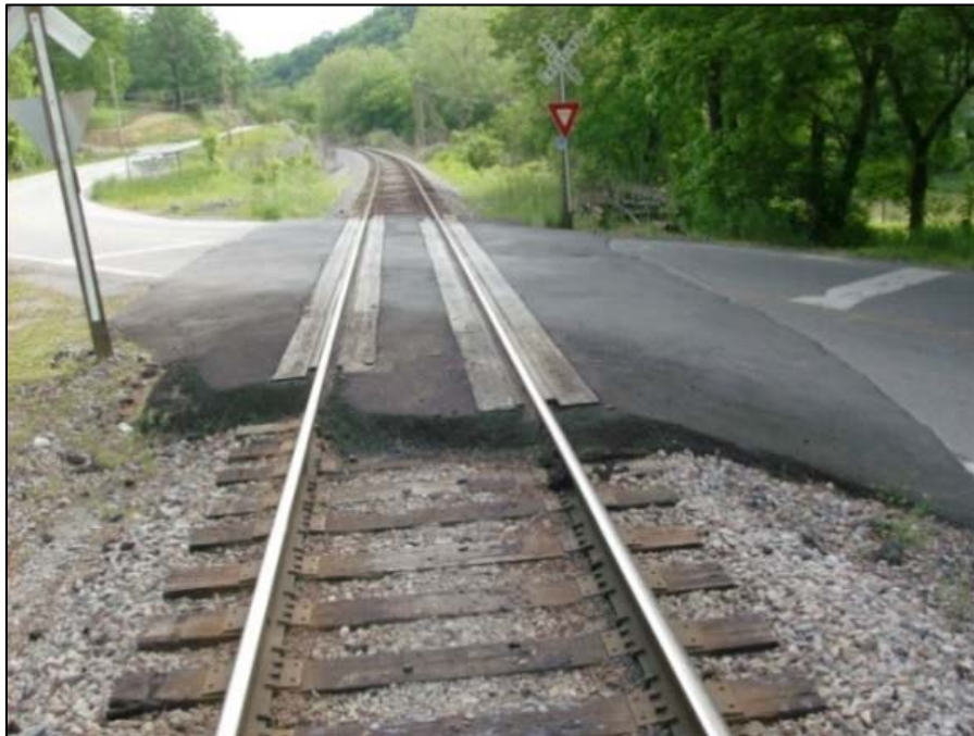
Typical Timber/Asphalt Crossing Surface

State transportation agencies and private railroad companies have expressed increased interest of late in incorporating asphalt underlayments and improved trackbed crossing designs and using premium materials in-lieu of traditional all-granular materials. These materials enhance the structural capability and waterproofing capacity of areas proximate to a railway/highway crossing; they will also extend the service lives of crossing surfaces. Technology-based design parameters and crossing management techniques for assessing optimal engineering solutions are now common practice for agencies responsible for crossing management and oversight. Numerous transportation agencies and organizations have issued guidelines and standards for the proper design and construction techniques for railway/highway at-grade crossings, including AASHTO, AREMA, FRA, FHWA, MUTCD, and several states. Comprehensive information was summarized for the States of Illinois, Indiana, Iowa, Georgia, Michigan, and West Virginia. These selected states have been successful in developing standard at-grade crossing management practices.