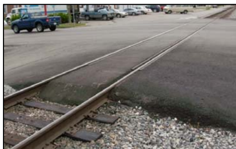
Typical Rubber/Asphalt Crossing Surface

Statutes are formal laws written and enacted by legislative bodies. Statutes differ from administrative regulations and case law in that legislative bodies enact them, whereas case law emerges from court rulings, and regulations are determined by governmental agencies. While in most states, administrative regulations spell out the jurisdiction of governing agencies over at-grade crossings, state statutes enshrine into the law the various aspects of grade crossing programs. In cases where states do not maintain a designated grade crossing program, statutes define specific regulations pertaining to railroad companies or grade crossings in particular. Chapter 277 of Title XXIV of the Kentucky Revised Statutes (KRS) governs the organization and operation of railroad companies in the state. Most of the information relating to grade crossings can be found in this chapter. Regulations mandating the now-defunct Railroad Commission are included in Chapter 276, and Chapter 174 of Title XV provides broad guidelines for KYTC.