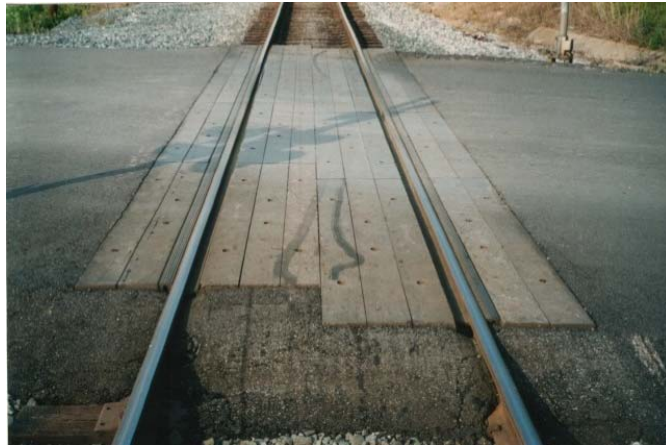
Typical Composite Crossing Surface

Various components of a crossing project are discussed in individual sections of the manual, including crossing surfaces and traffic control devices.