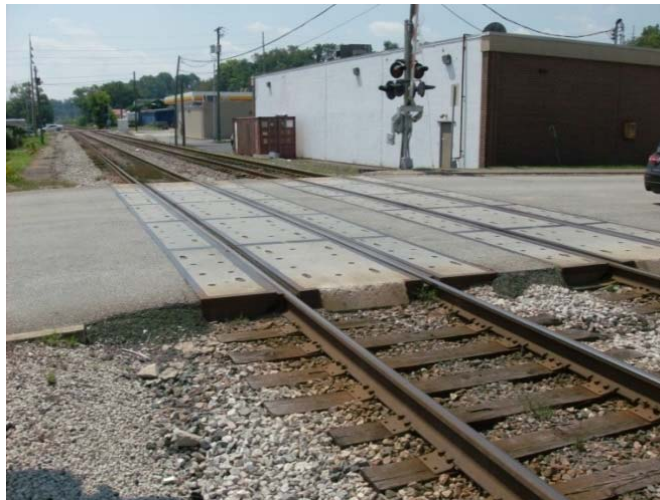
Typical Concrete Panel Crossing Surface