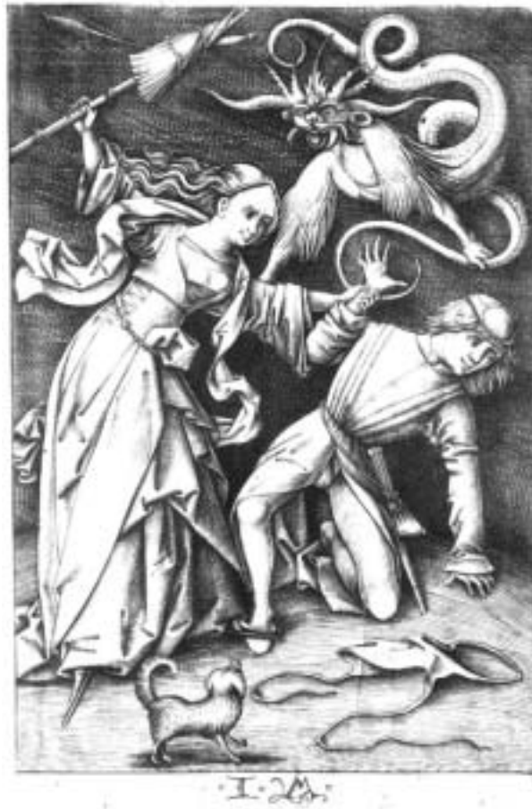
The Angry Wife by Israhel van Meckenem 1495-1503 National Gallery of Art

One of the most popular portrayals was that of the ‘virago’ or woman who would use physical force when she could not subdue men through sexual advances or entrapment. Prints such as The Angry Wife by Israhel van Meckenem (copies of which are held