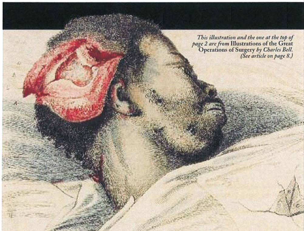
This illustration and the one at the top of page 2 are from Illustrations of the Great Operations of Surgery by Charles Bell. (See article on page 8.)