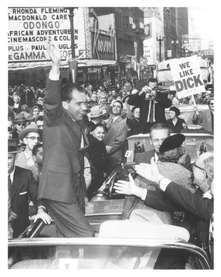
Nixon on State Street in Chicago—a classic campaign photo from the 1956 presidential election. Dr. Lungren stands in the Secret Service car behind Nixon's, taking a photograph of him.