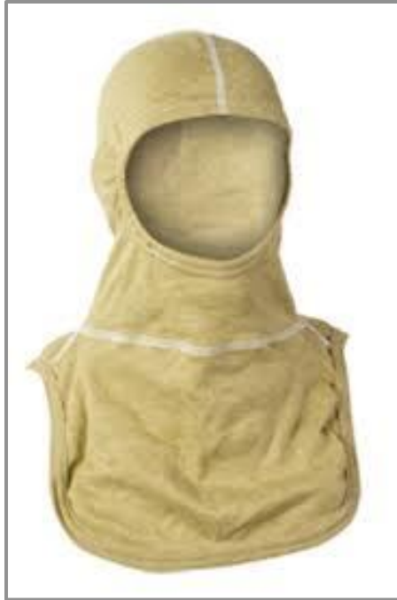
Figure 3.1. Illustration of Nomex® Hood

Ten Nomex® hoods were obtained from the Philadelphia Fire Department; one new hood was used as a control, and the remaining nine were evaluated to identify the composition of soils. Specimens were removed from the hood samples and analyzed to identify the composition of soils and the presence of hazardous materials in or on the fire resistant fabric. Previous (unrelated) investigations found that soils and the presence of hazardous materials in or on flame resistant fabric can affect the flame resistant properties. Due to the nature of the fabric properties, hoods will stretch and wear out and because of the low cost of replacement, they typically are not laundered. As a result of the low cost, the hoods are often used only a few times and thrown away once they have been soiled in exchange for a new hood. Since the hoods are often worn only a few times before disposal and have not been subjected to laundering, the soiled hoods are considered to be a worst-case scenario of soiling.