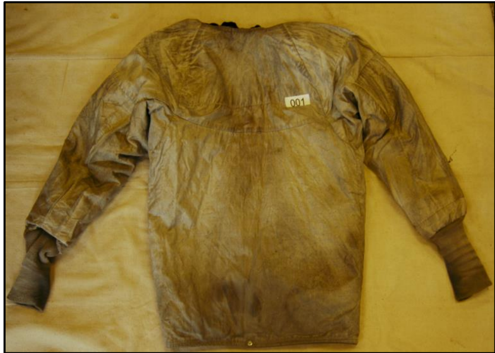
Figure 3.2. Photographs of Soiled Turnout Gear Chosen for Analysis

Preparation of Specimens. For the purpose of analysis, areas of the turnout gear where the skin has been shown to have high dermal absorption were identified as areas to remove specimens for analysis. These areas were selected based on the Maibach 1971