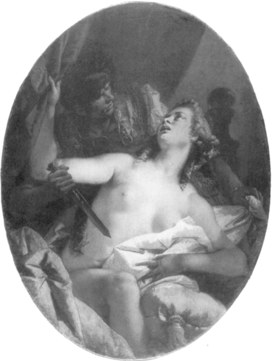
Figure 1. Giambattista B. Tiepolo, Tarquin and Lucretia (1750).