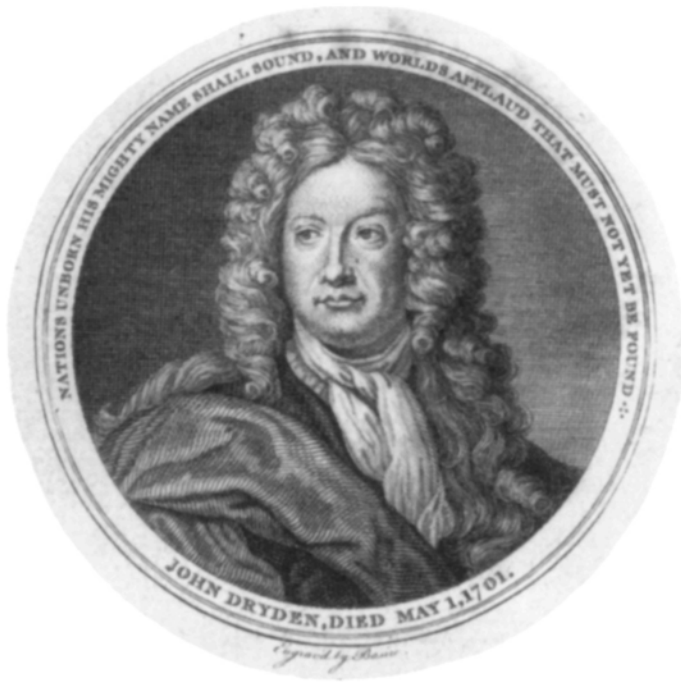
Figure 3. Frontispiece from [John Nichols, ed.] A Select Collection of Poems: With Notes Biographical and Historical (London: 1780-82). By permission of the British Library, 238.e.15.

We often say that the canonical and bourgeois object, high literature, had to be moralistic to please the bourgeoisie. But then we also say, contradictorily, that aesthetic considerations are separate from moral ones. 110 It is true that if one compares early-eighteenth-century aristocratic miscellanies with later anthologies, a middle-class moralism seems to inform the anthology-compiler's principles of selection. Unlike Hazlitt's or Headley's collections, Dryden's Miscellanies contain sexually explicit, seductive poems. 111 The bawdy collection Deliciae Poeticae; or Parnassus Display'd , is written by "Philomusus," and this lover of the female muses is meant not at all in the transcendent but rather in the physical sense. 112 Many miscellanies are therefore Academy of Compliments volumes, 113 designed to further one's amorous exploits, and many more are entitled The Ladies Miscellany , early in the century designating collections designed to seduce women, 114 only much later designating those designed to instruct them in virtue. 115 Curll's 1718 Ladies Miscellany , Benedict tells us, promises to give readers "many