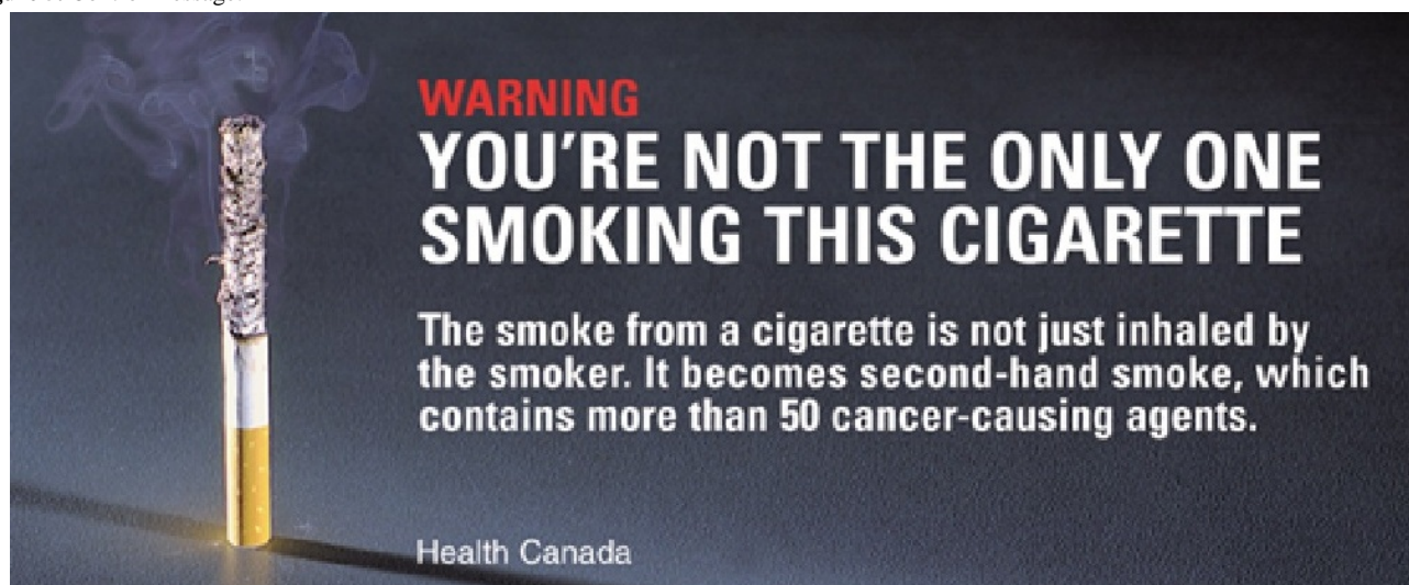
Figure 5. Control message.