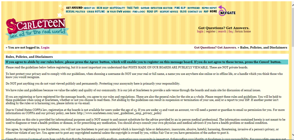
Figure 2. Screenshot of Rules, Policies, and Disclaimers

The main Scarleteen website also lists these guidelines and a more extensive discussion of the privacy policy (“User Guidelines and Privacy Policy,” n.d.).