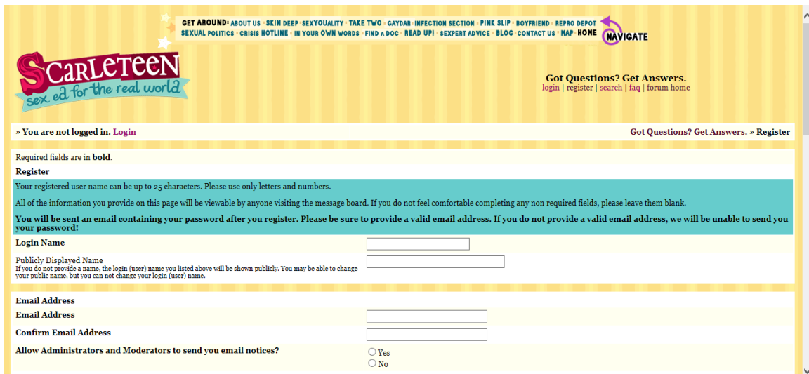
Figure 3. Screenshot of registration form.

After accepting the privacy policy, the new user then chooses a unique user name and submits some basic information such as an email address (which is not shared or available to the public).