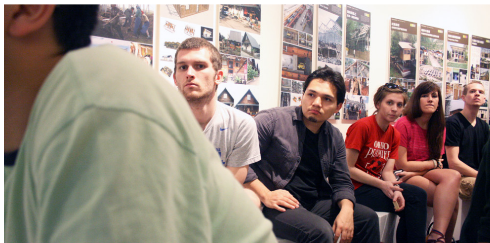
UK Office Studio students during a review of their work in the School of Architecture.