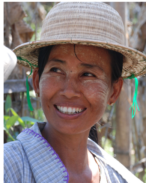
A Burmese farmer.