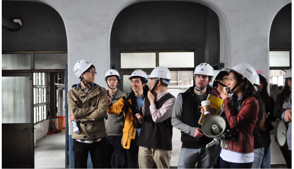
Students in Office Studio exploring the soon-to-be-decommissioned train depot station located in the Xinyi Business District, site of the famous Taipei 101 tower.

During this past Spring Break, 12 UK students, led by Co, joined 20 students from the partner schools in Taiwan and Hong Kong on a sponsored visit to Taipei where