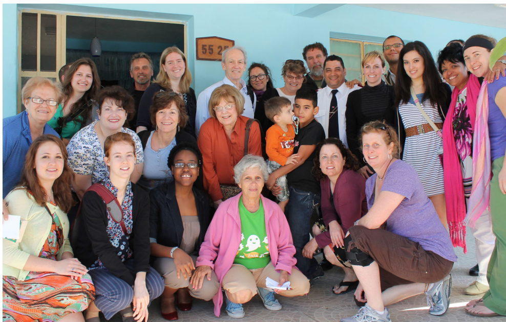
The UK delegation at a nursing home in Havana, Cuba.

Unlike many developing countries Cuba does not have a shortage of physicians. There is a doctor for every 170 residents in Cuba, which is the second highest ratio in the world according to the World Health Organization. The surplus allows