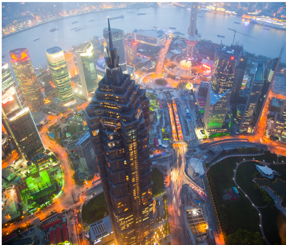
The Jin Mao Tower in the Lujiazui area of the Pudong district of Shanghai, China.