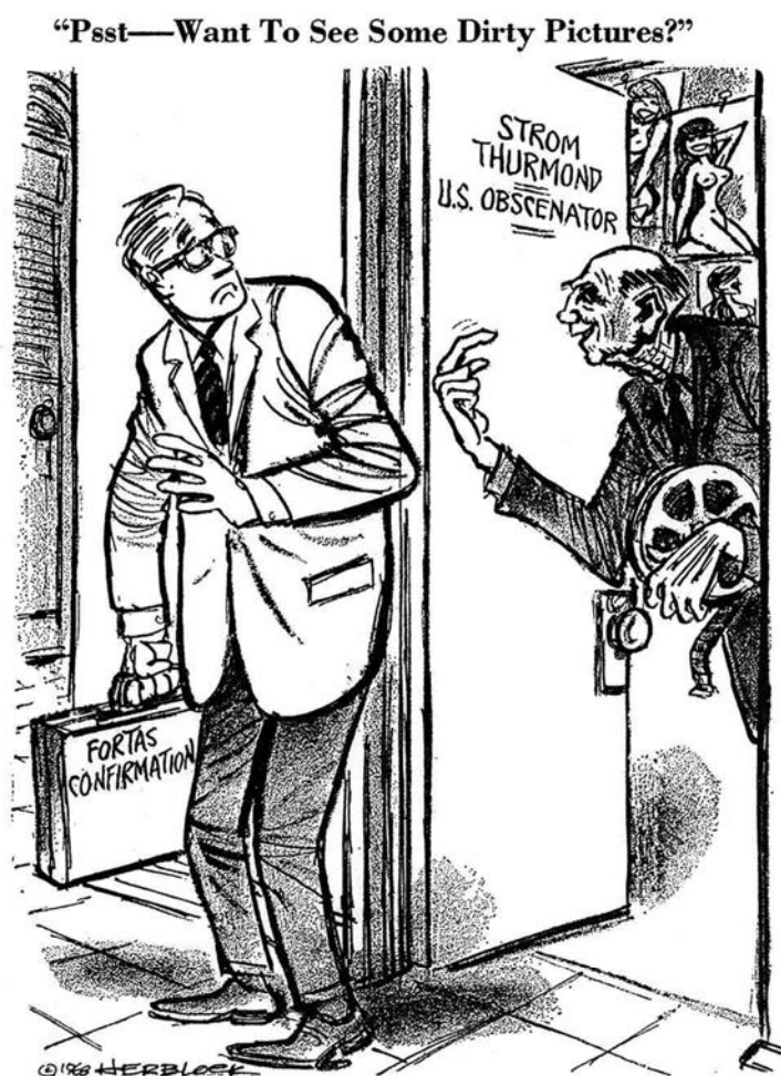
A 1968 Herbblock Cartoon, copyright by The Herb Block Foundation.

office full of pin-ups, whispering to passersby, “Psst – Want to see some dirty pictures?” 370 The New York Times complained that the Fortas hearings were “dominated by Senator Thurmond of South Carolina, whose gutter-level assault on Justice Fortas is based on movies the Senator has been showing Congressmen behind the scenes.” 371 Even the Wall Street Journal objected, claiming “Senator Thurmond was unnecessarily discourteous to Mr. Fortas. Pornography is not one of the nation’s truly burning issues, and showing stag films is not our idea of how to run the world’s greatest deliberative body.” 372