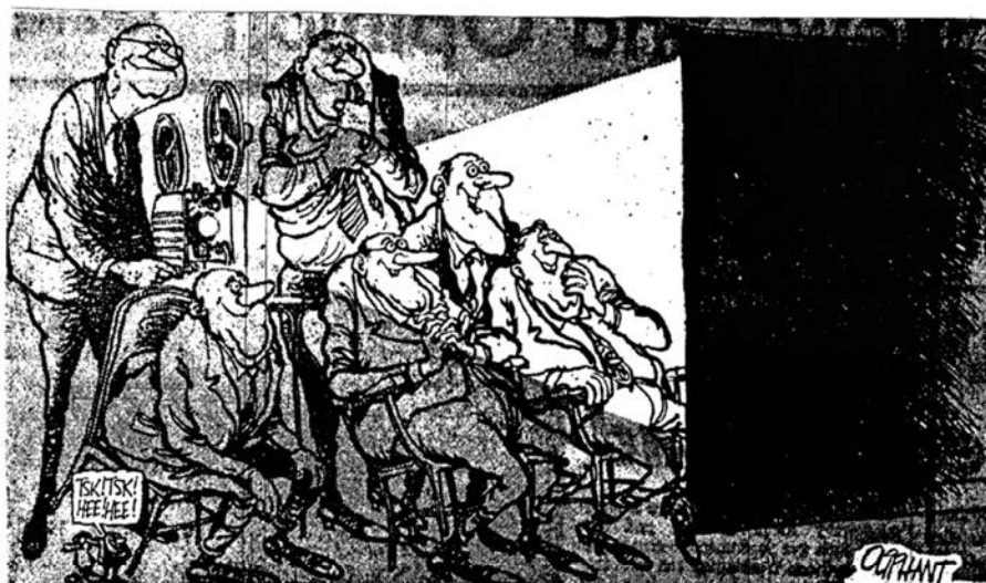
Senators Judiciary Committee members are 'anxious to see' the strip-tease film which Abe Fortas ruled as not pornographic. . . . News Item

Day after day last week, Thurmond buttonholed his colleagues to watch the films in darkened Senate offices. One aide of Richard Nixon called it “the Fortas Film Festival.” The Senators were not titillated but shocked, and they left the showings in a grim mood. The screenings apparently swayed some votes away from Fortas. Senators know that middle-class opposition to pornography is rising, and the subject—like the Supreme Court itself—has become a symbol of what is wrong in the U.S. 367