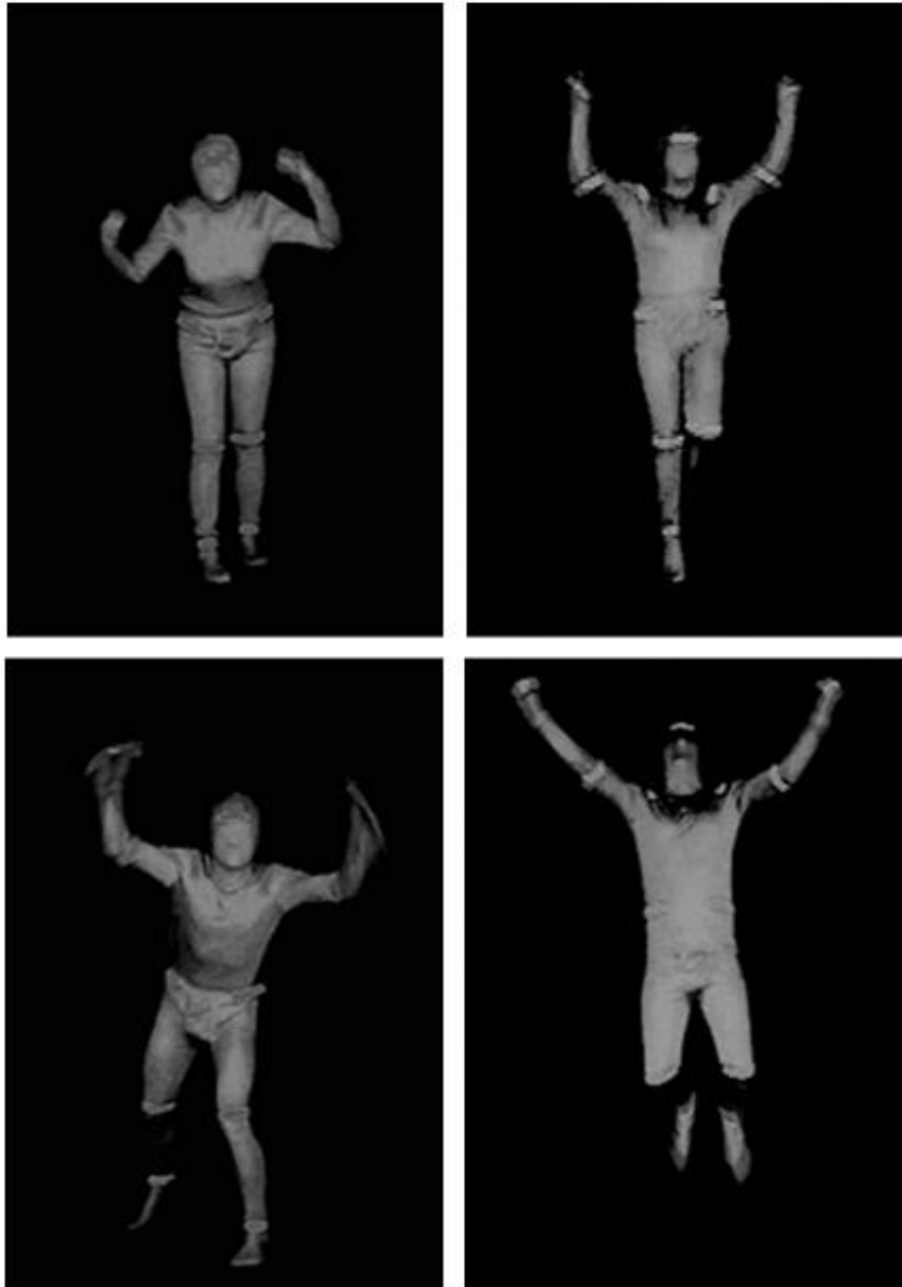
Figure 8.1. Examples of still frames taken from a female pair (top row) and a male pair (bottom row) used as stimuli in Experiments 2A and 2B. Infants viewed one of four angry-happy body pairs; in the above pairs, angry body movements appear on the left and happy body movements are on the right.