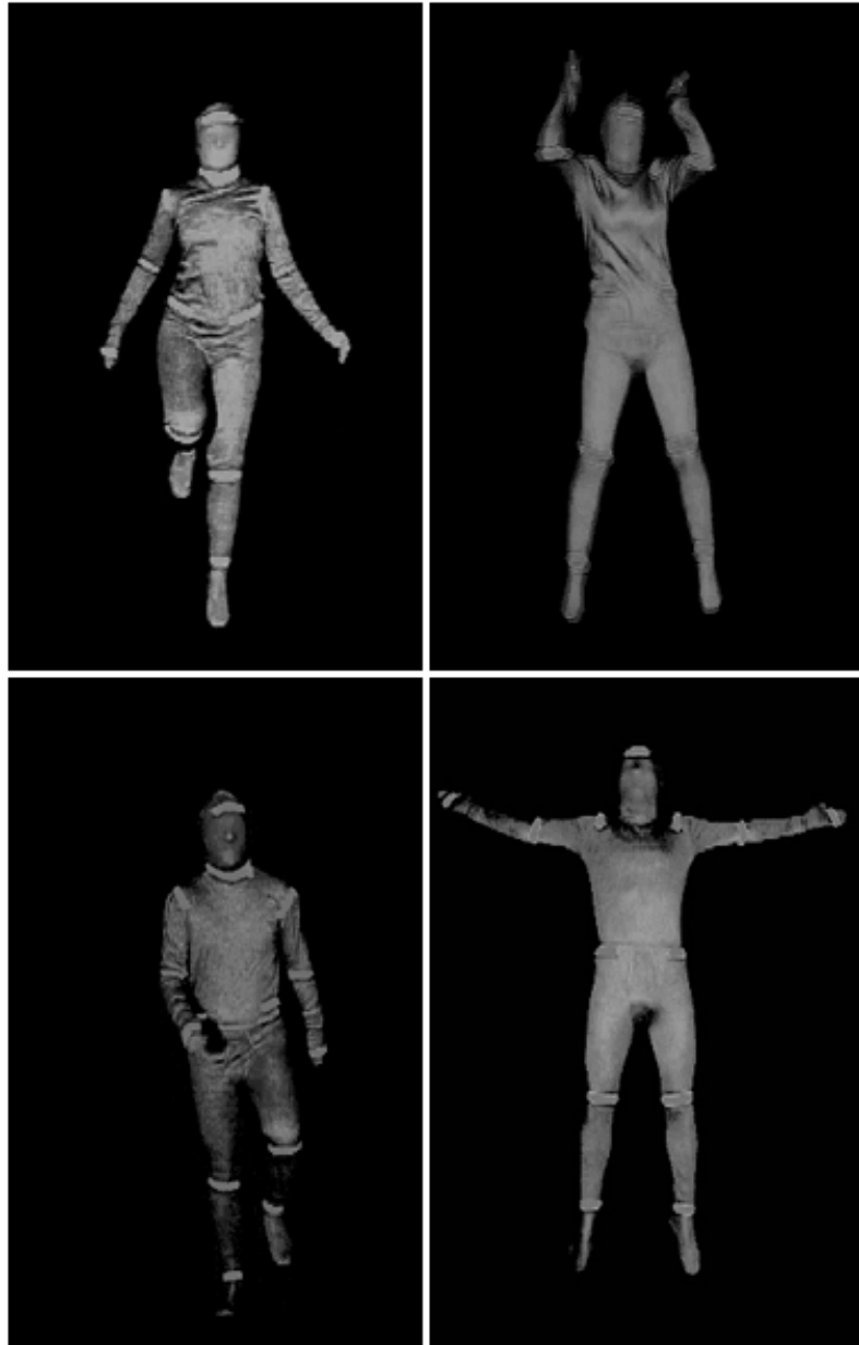
Figure 6.1. Examples of still frames taken from videos of neutral (left) and happy (right) body actions that infants viewed in Experiment 1. The female pair (top) depicts a woman jumping in place (left) and a woman jumping in a happy manner (right). The male pair (below) shows a man walking in place (left) and a man in the midst of a happy jump (right). Infants were assigned to view one of four happy-neutral pairs (2 male, 2 female) used in Experiment 1.