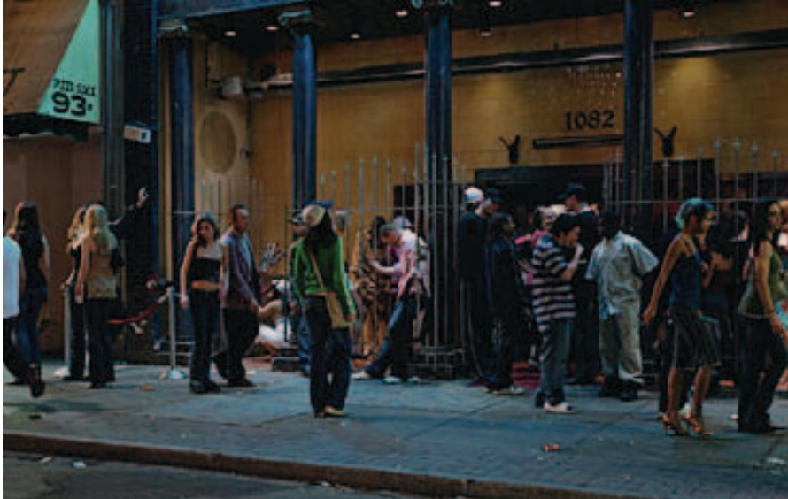
Figure II.5 Jeff Wall, In Front of a Nightclub , 2006, 226 x 360.8 cm, Transparency in lightbox. http://db-artmag.com/archiv/assets/images/561/34.jpg Collection of the Pilara Family Foundation.