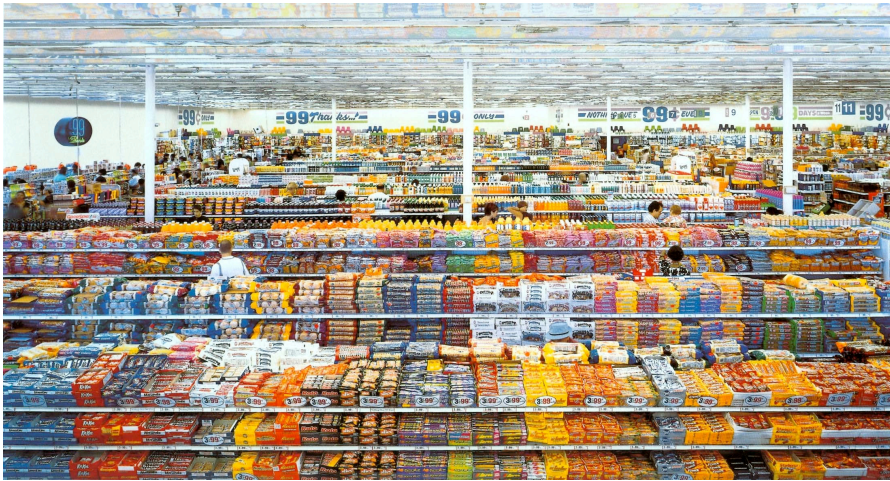
Figure II.6 Andreas Gursky, 99 Cent. , 1999, 207 x 337 cm. http://www.moma.org/interactives/exhibitions/2001/gursky/images/99cent_pop.jpg