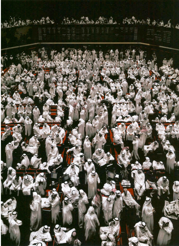
Figure II.7 Andreas Gursky, Kuwait Stock Exchange , 2007, 295.1 x 222 cm.

http://static.royalacademy.org.uk/images/width270/screen-shot-2010-11-09-at-12-39-32-11561.png