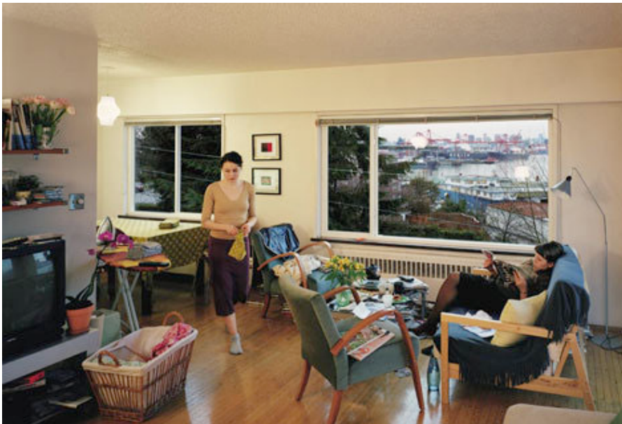
Figure II.4 Jeff Wall, A View from an Apartment , 2004-2005, 167 x 244 cm, Transparency in lightbox.

http://www.fotomuseum.ch/presse/0606_GC/04.BeneathTheRoses.300dpi.jpg