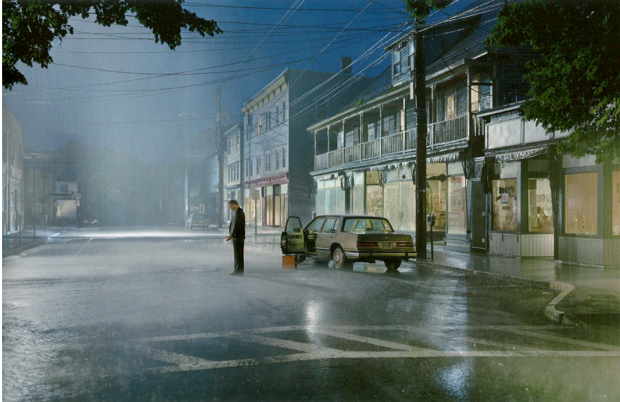
Figure II.3 Gregory Crewdson, Untitled , 2003-2005, 'Beneath the Roses' Series, 144.8 x 223.5 cm, Digital C-print.

http://www.fotomuseum.ch/presse/0606_GC/04.BeneathTheRoses.300dpi.jpg