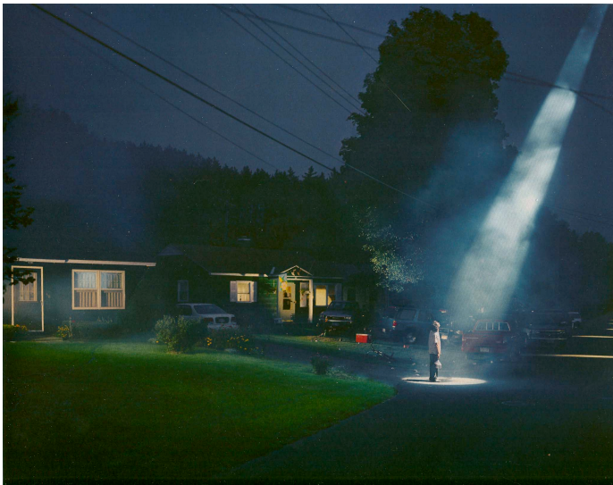
Figure II.2 Gregory Crewdson, Untitled , 1998-2002, 'Twilight' Series, 121x 152.4 cm Digital C-print.

0/TKqZeEo7f6I/AAAAAAAAAHA/SfMoFpXiw_A/s1600/Gregory+Crewdson+2.jpg