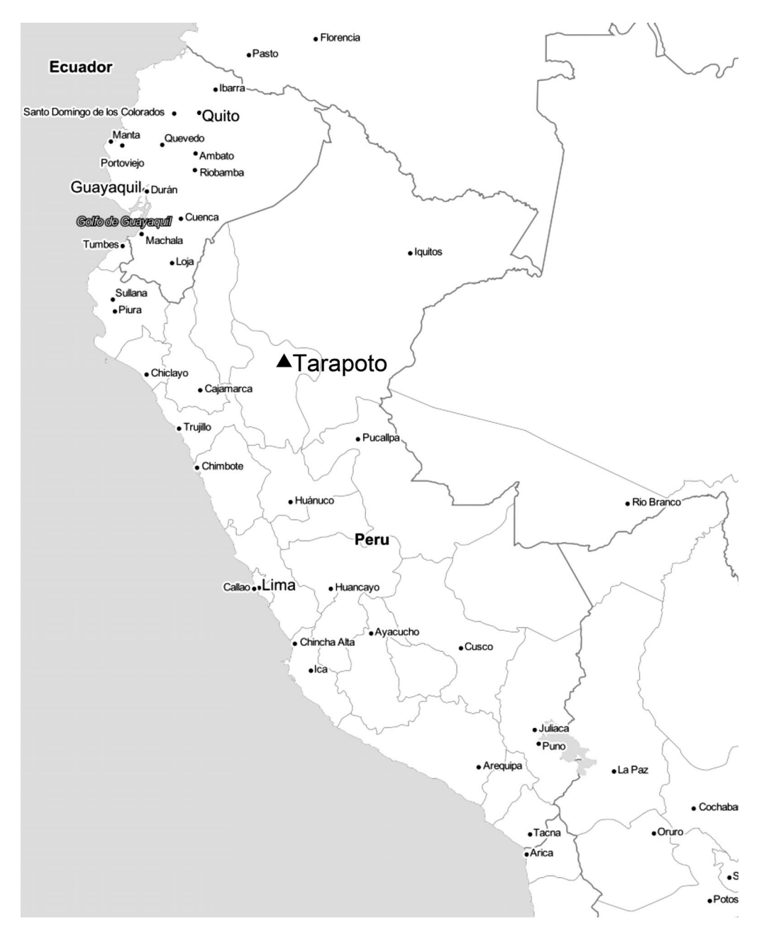
Fig. 1. Map of our study site near Tarapoto, in the Department of San Martin, in Peru. Tarapoto is indicated with a triangle.

visual model function provided in the 'pavo' package (Vorobyev et al., 1998) against the average reflectance of three Dieffenbachia leaves taken in the field. We chose to use Dieffenbachia reflectance because R. imitator frequently breeds in Dieffenbachia (Brown et al., 2008b) and all males were seen on these plants during this study. The visual model function is based on stimulation of different cone types, and assumes that color discrimination is in large part limited by receptor noise (Vorobyev et al., 1998). This calculation allows us to examine both chromatic (dS, color-based) and achromatic (dL, luminance or brightness) contrast to the background in units of justnoticeable differences (JNDs), a unit of differentiation in which JND = 1 indicates a difference that is at the threshold of discrimination for a viewer (derived from Vorobyev et al., 1998). We used the average avian visual system and ideal, white illumination in our visual model (data provided within 'pavo').