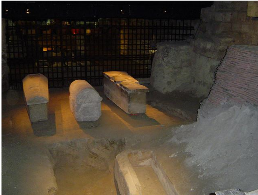
Figure 6: Original Crypt, St. Denis