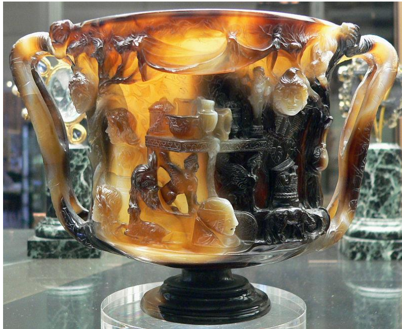
Figure 18: Cup of Ptolemies, 1 st century CE, Bibliothèque Nationale de France, Paris