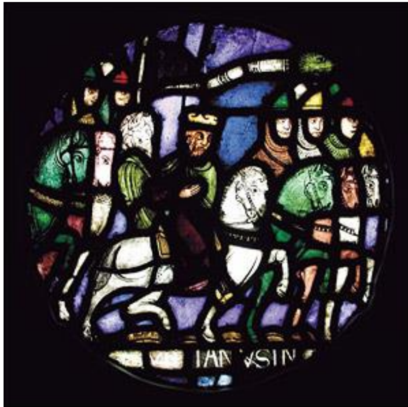
Figure 11: Crusader Window, 1140's, St. Denis