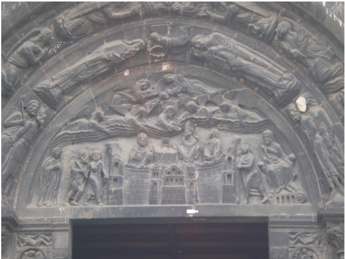
Figure 3: Right Portal Tympanum, St. Denis