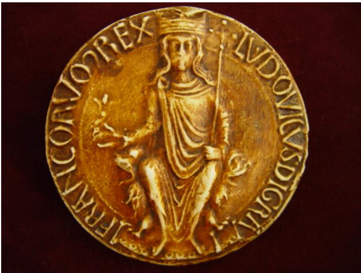
Figure 21: Royal Seal of Louis VII, 1137, Paris