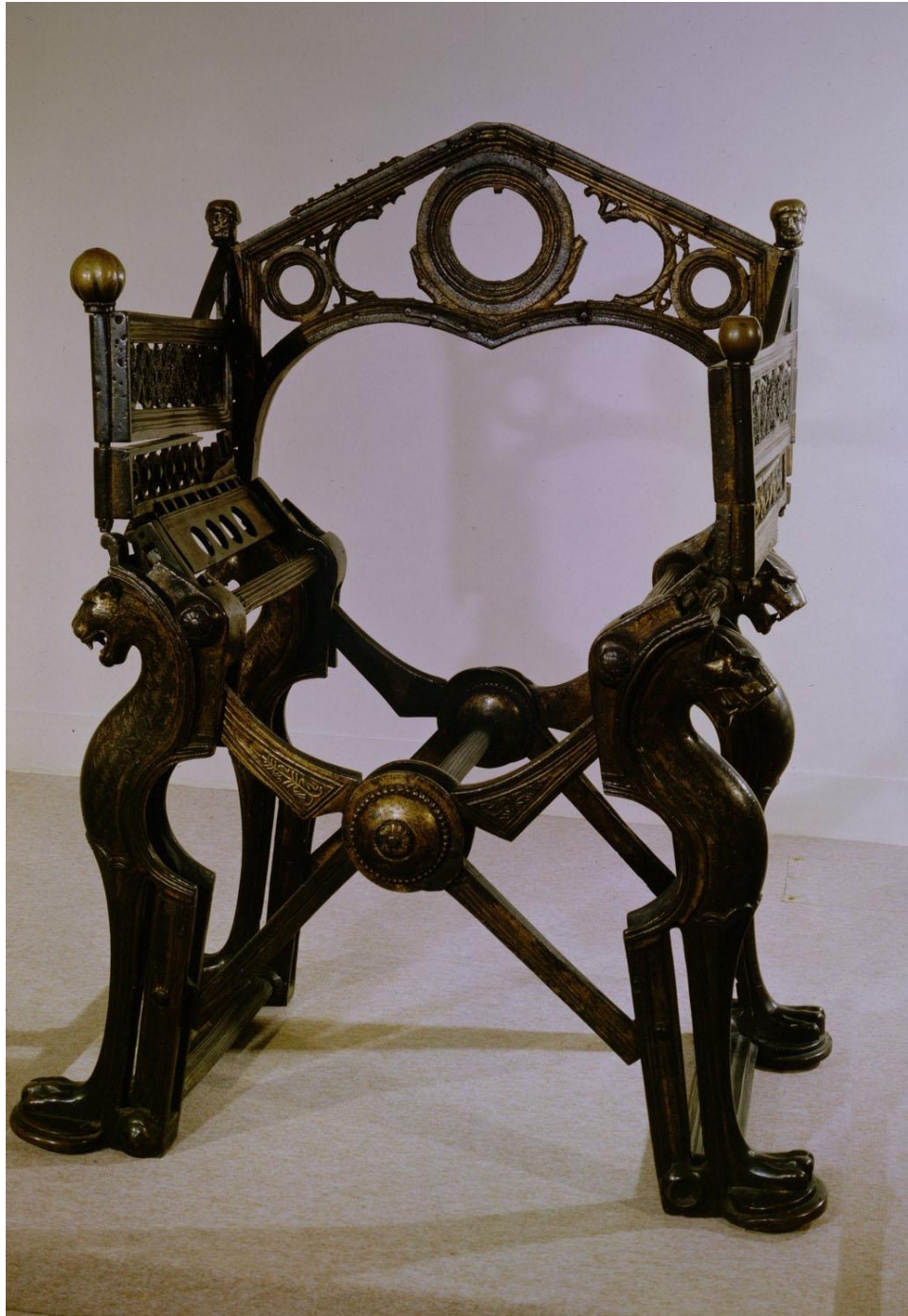
Figure 20: Throne of Dagobert, 7 th & 12 th century, National Library of France