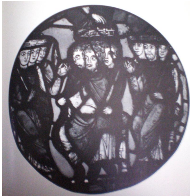
Figure 13: A Triple Coronation, 1150, St. Denis