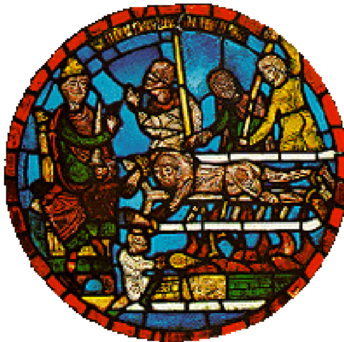
Figure 14: Martyrdom of St. Vincent, 12 th century, St. Denis