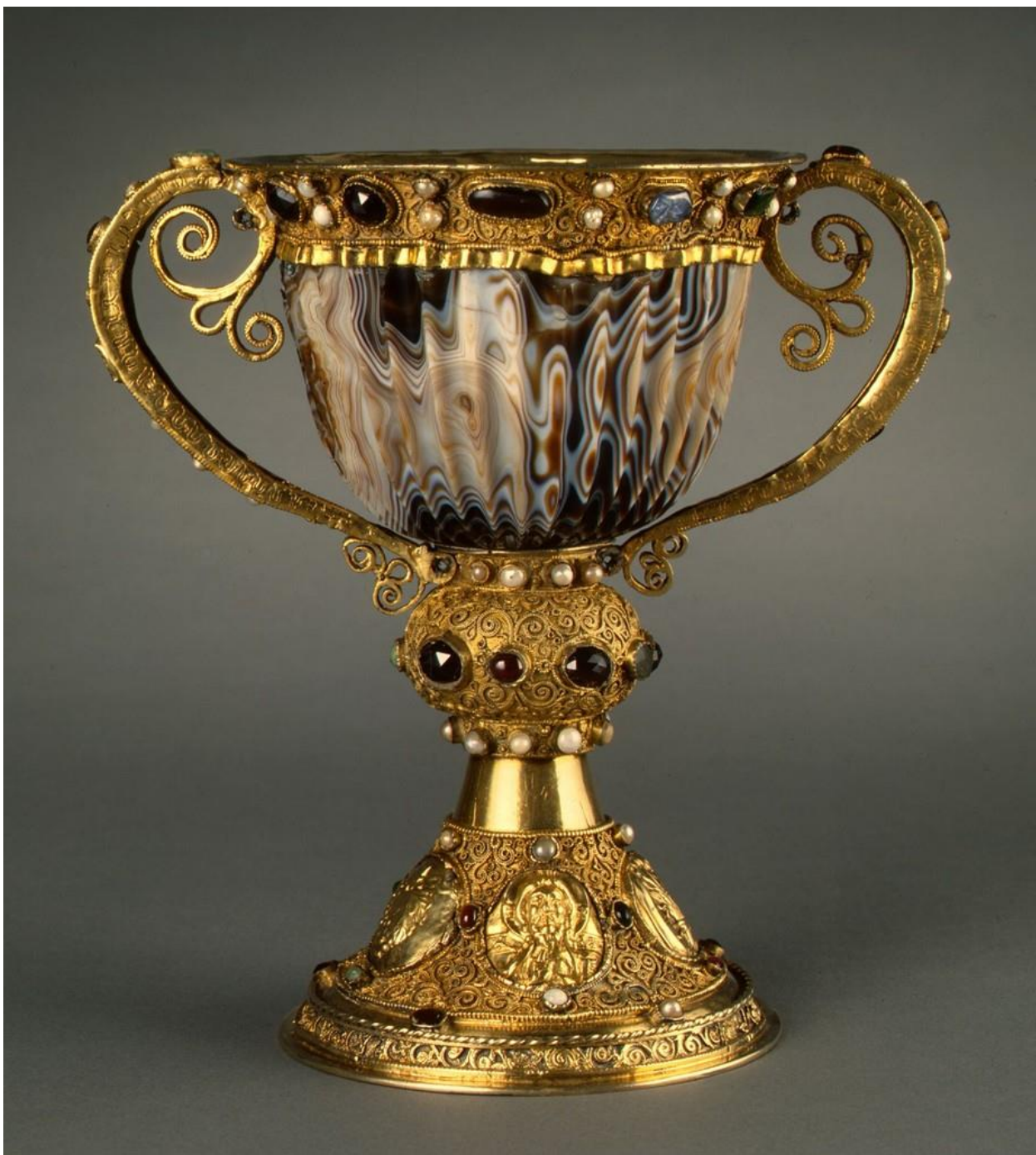
Figure 15: Suger's Chalice, 1147(?), The National Gallery Washington D.C.