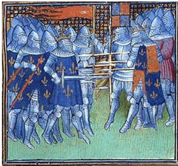
Figure 12: Oriflamme, The Battle of Poitiers 1356, 1350's