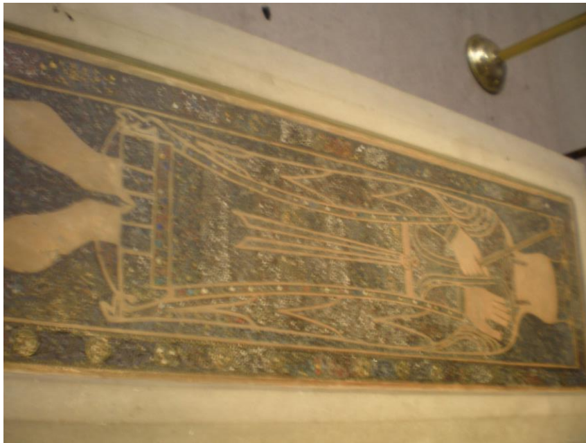
Figure 7: Tomb of Frédégonde, St. Denis (545-597)