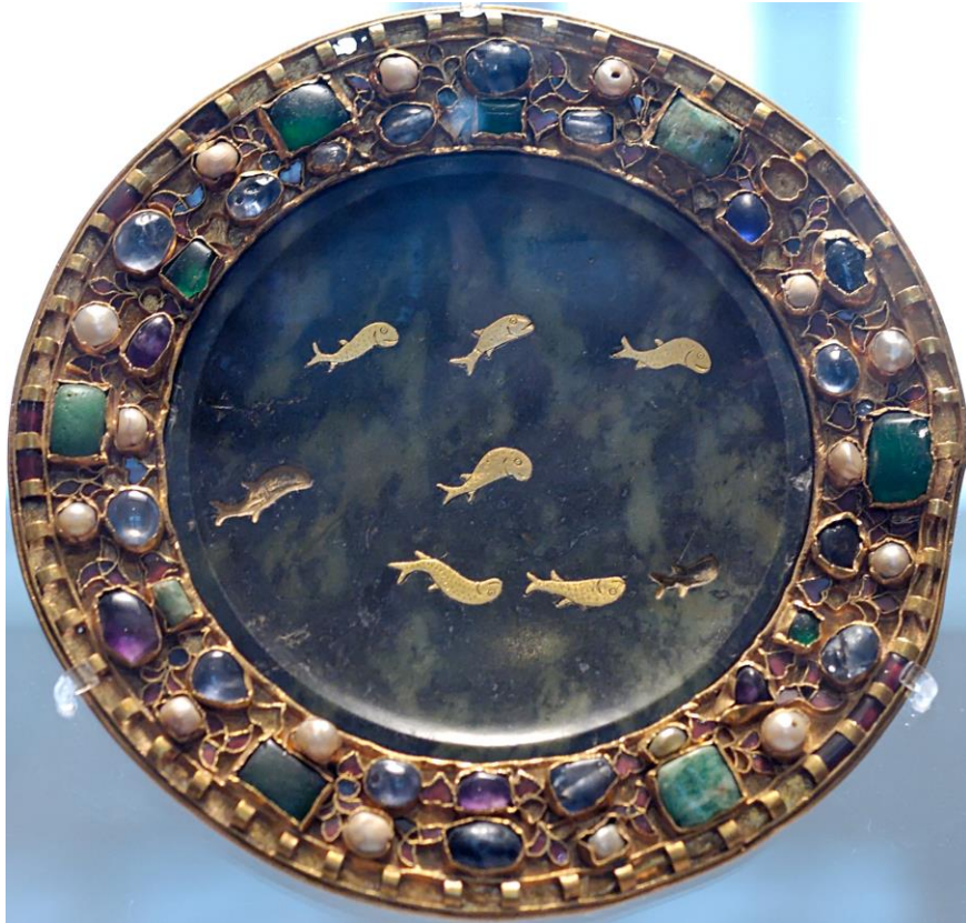
Figure 17: Serpentine Paten, 1 st century BCE or 1 st century CE, Louvre, Paris