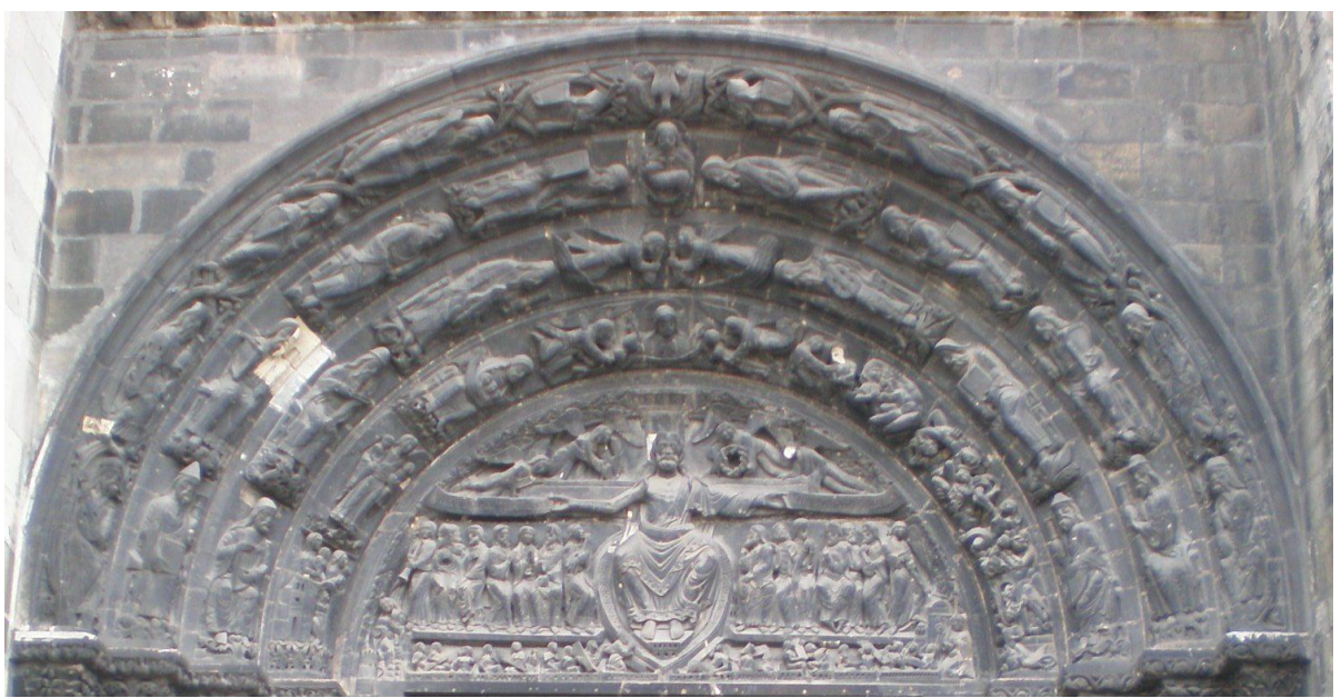
Figure 2: Central Portal, The Last Judgment, St. Denis