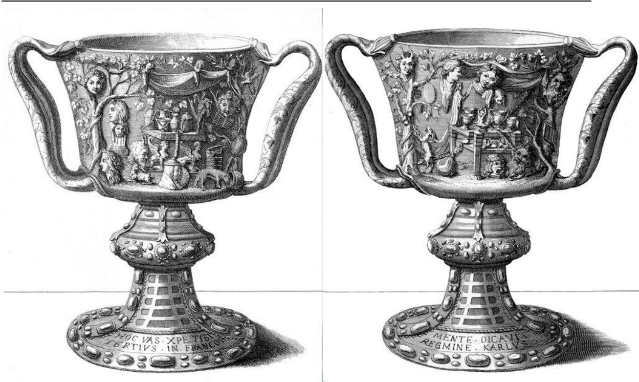
Figure 19: Cup of Ptolemies (enhanced), 12 th century, Not surviving