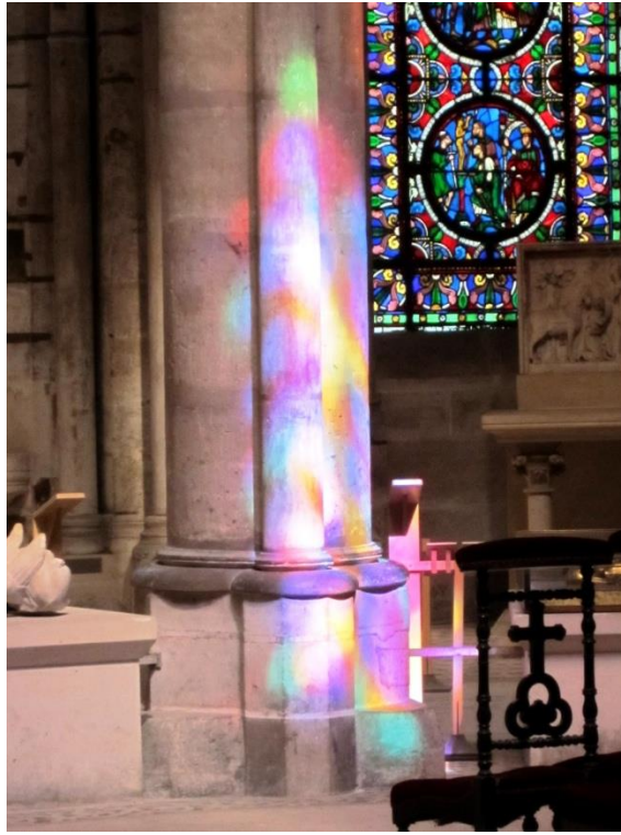
Figure 9: Illumination from Stained Glass, St. Denis