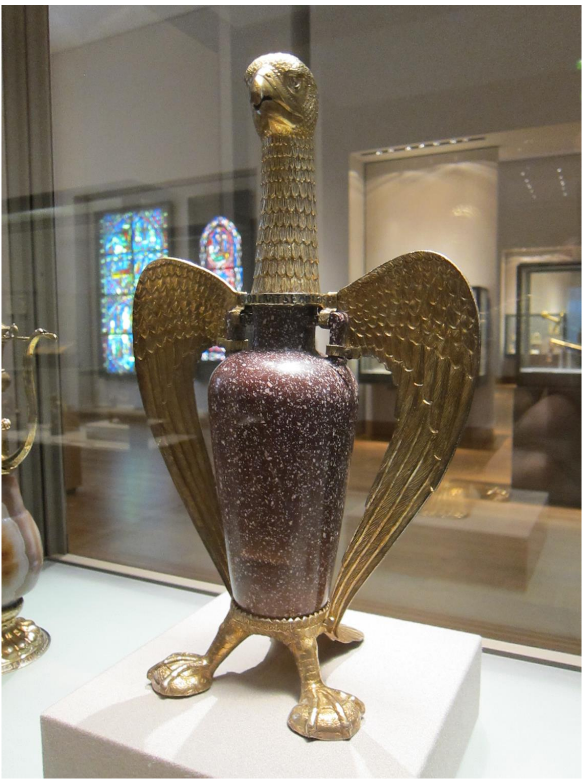
Figure 16: Suger's Eagle Vase, 1147(?), Louvre, Paris