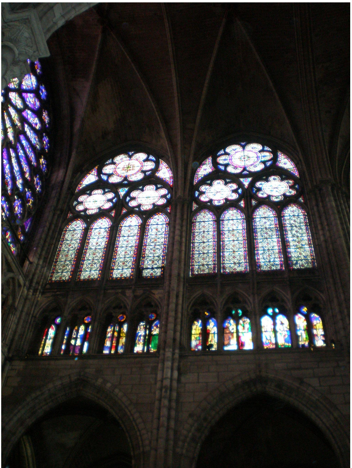
Figure 8: Northern Transept Clerestory Windows, St. Denis