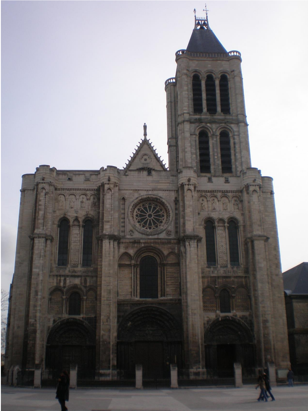
Figure 1: St. Denis