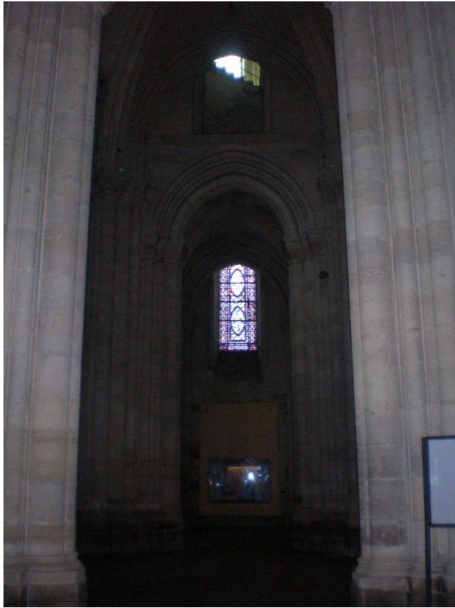
Figure 4: Narthex of St. Denis, St. Denis