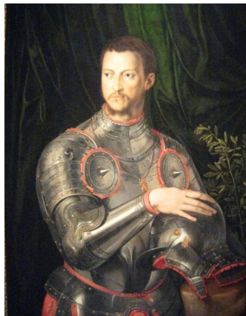
Figure 20. Workshop of Bronzino, Portrait of Cosimo I de' Medici in Armor , 1545. Oil on wood, 101 x 77 cm. The Toledo Museum of Art.