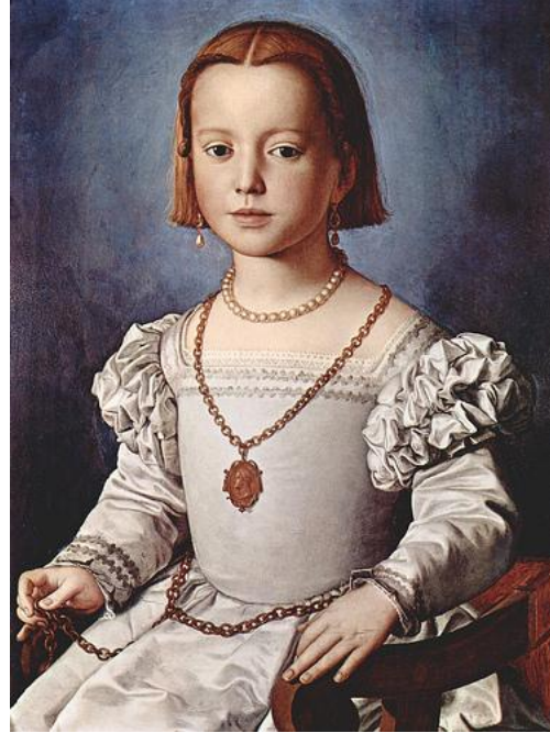
Figure 15. Bronzino, Portrait of Bia de' Medici (Wearing a Medal of Cosimo I) , c. 1542. Tempera on panel, 63 x 48 cm. Galleria degli Uffizi, Florence.