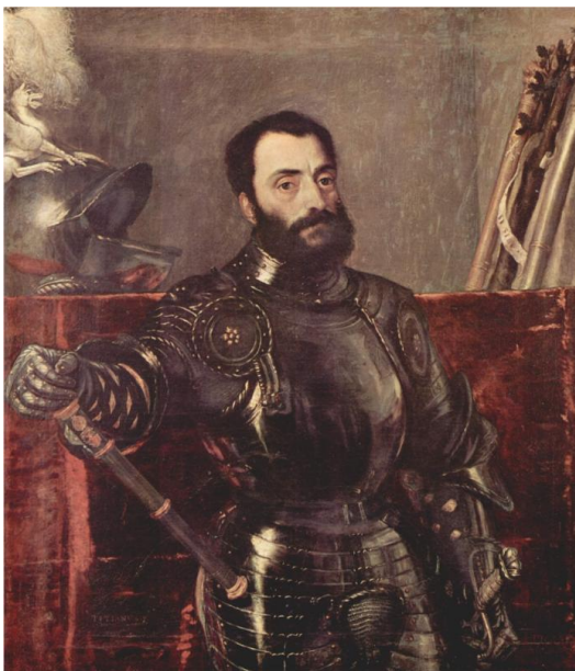
Figure 18. Titian, Portrait of Francesco Maria della Rovere , 1536-1538. Oil on canvas, 114 x 100 cm. Galleria degli Uffizi, Florence.