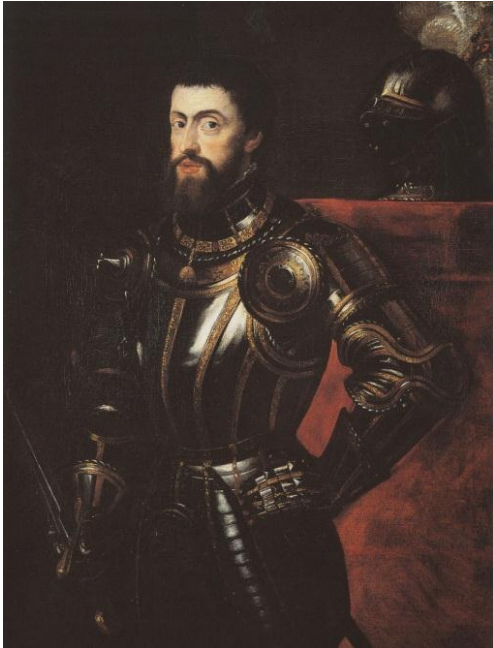
Figure 17. After Titian, Portrait of Emperor Charles V in with Drawn Sword , c. 1600-1605. Oil on canvas, 119 x 62 cm. Private collection, England.