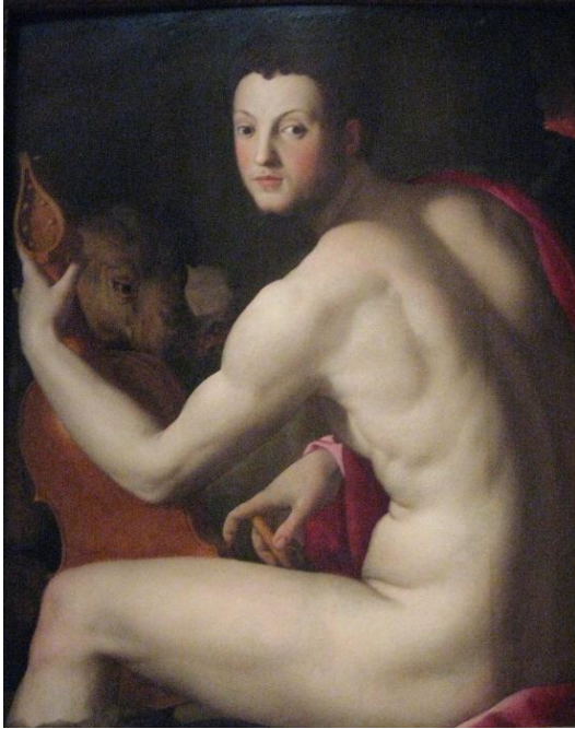
Figure 14. Bronzino, Cosimo I as Orpheus, c. 1537-1539. Oil on Wood, 93.7 x 76.4 cm. Philadelphia Museum of Art.