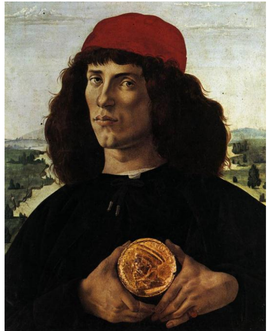
Figure 5. Botticelli, Portrait of a Man Holding Medal of Cosimo de' Medici , c. 1475. Tempera on panel. Gilded stucco for the Medal. Galleria degli Uffizi, Florence.