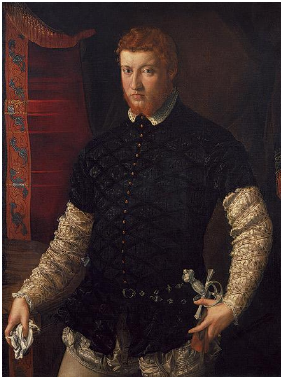
Figure 22. Francesco Salviati, Portrait of a Man . Oil on Canvas, 123 x 93 cm. Metropolitan Museum of Art, New York.