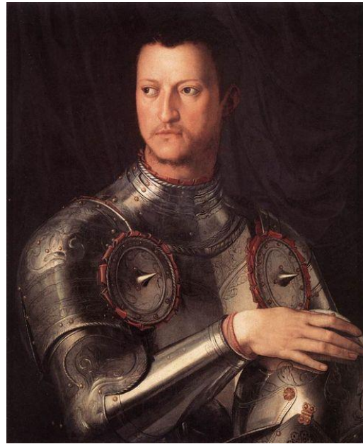
Figure 16. Bronzino, Portrait of Cosimo I de' Medici in Armor , c. 1543. Tempera on Panel, 74 x 58 cm. Tribuna della Galleria degli Uffizi, Florence. Inv. 1890, no. 855