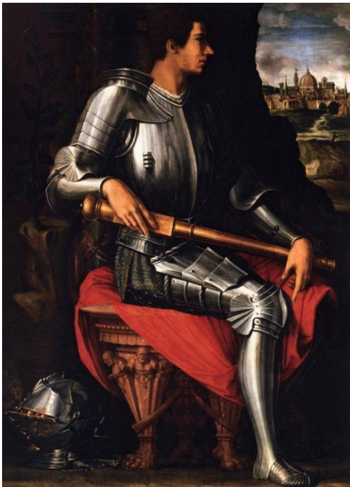
Figure 11. Giorgio Vasari, Portrait of Alessandro de' Medici , 1533-1534. Oil on panel. Galleria degli Uffizi, Florence.