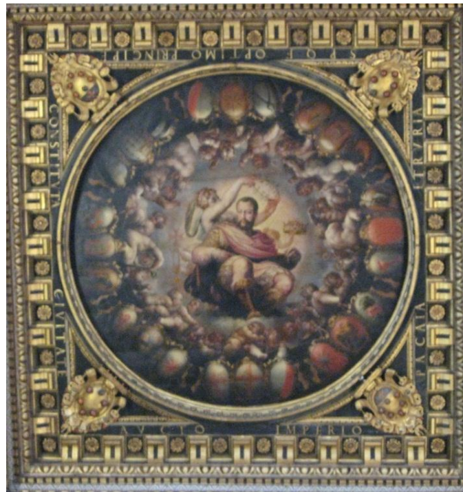
Figure 29. Vasari, Apotheosis of Duke Cosimo de' Medici , c. 1565. Oil on Wood. Sala Grande del Cinquecento in the Palazzo Vecchio, Florence.