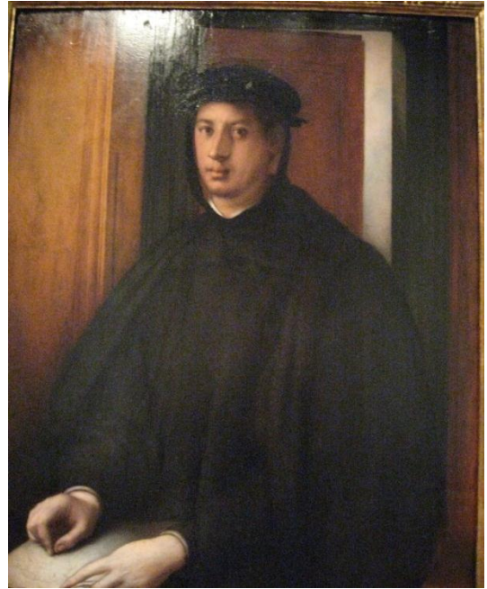
Figure 12. Pontormo, Portrait of Alessandro de' Medici, 1534-1535. Oil on panel, 101.3 x 81.9 cm. Philadelphia Museum of Art.