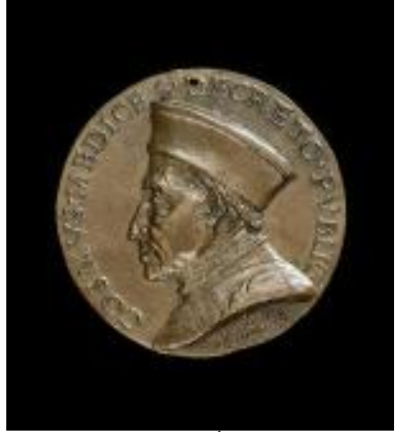
Figure 4. Florentine 15 th Century, Cosimo de' Medici , c. 1465-1469. Bronze Medal, Diameter 7.8 cm. National Gallery of Art, Washington D.C. 1957.14.840.a