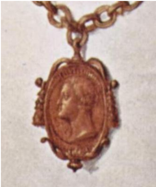
Figure 15a. Bronzino, Portrait of Bia de' Medici (Detail of medal obverse) , c. 1542. Tempera on panel. Galleria degli Uffizi, Florence