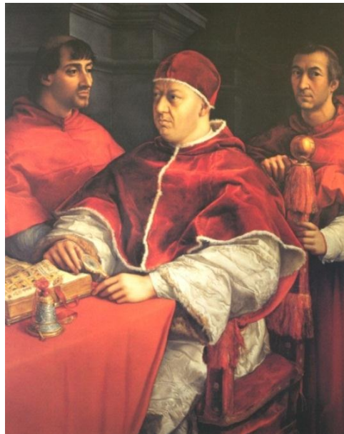
Figure 9. Raphael, Leo X with Cardinals Giulio di' Medici and Luigi de' Rossi , 1518. Tempera on Wood, 154 x 119 cm. Galleria degli Uffizi, Florence.