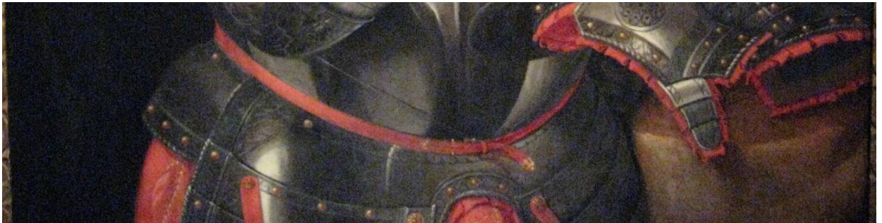
Figure 20a. Workshop of Bronzino, Portrait of Cosimo I de' Medici in Armor (Detail), 1545. Oil on panel. The Toledo Museum of Art.