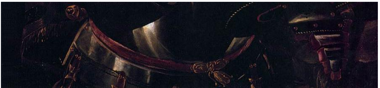
Figure 23. Workshop of Bronzino, Portrait of Cosimo I de' Medici in Armor (Detail), c. 1545. Oil or tempera on panel. Gemäldegaleri Alte Meister, Kassel, Germany.