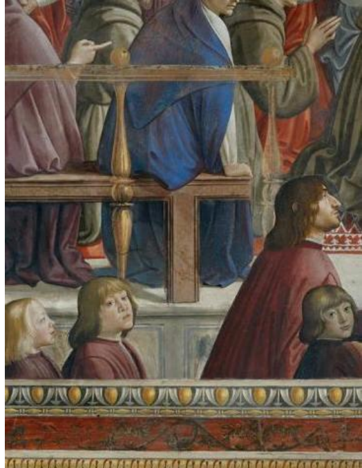
Figure 8. Domenico Ghirlandaio, The Confirmation of the Rule of the Franciscan Order (Detail) , c. 1483. Fresco. Sassetti Chapel, Santa Trinità, Florence.