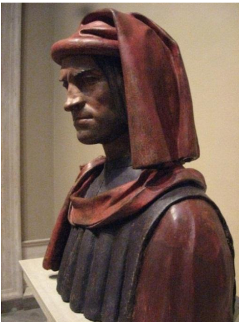
Figure 7. Florentine 15 th or 16 th Century (After Verrocchio), Lorenzo de' Medici , 1478/1521. Painted terracotta. National Gallery of Art, Washington D.C.