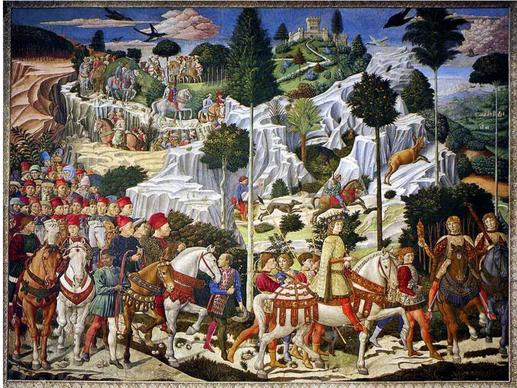
Figure 1a. East Wall