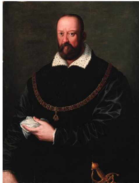
Figure 27. Alessandro Allori (after Bronzino), Portrait of Cosimo de Medici I , c. Late 16 th /Early 17 th Century. Oil on panel, 116 x 90 cm. Sold Christie's New York on 1/27/2000. (Sale 9318/Lot 183)