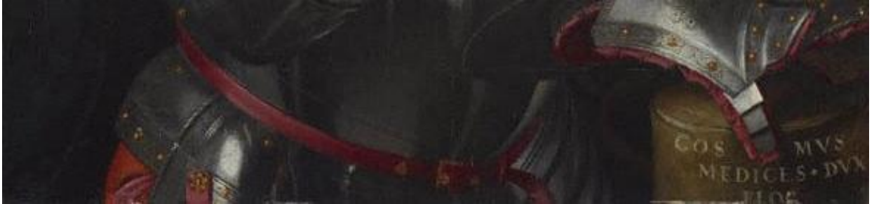
Figure 19a. Bronzino, Portrait of Cosimo I de' Medici in Armor (Detail), 1545. Oil or tempera on Panel. Art Gallery of New South Wales, Sydney. 78.1996