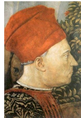
Figure 1b. Cosimo Figure 1c. Lorenzo, Giuliano, Pius II, and artist Figure 1d. Piero