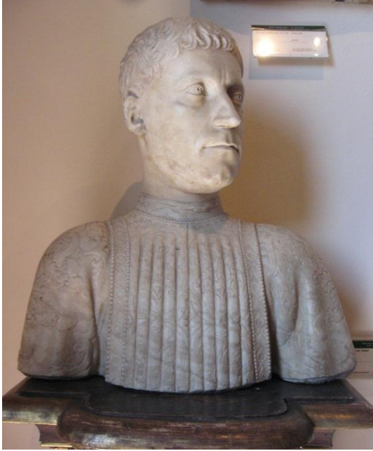
Figure 2. Mino da Fiesole, Piero di Cosimo de' Medici, c. 1453-1454. Marble. Museo Bargello, Florence. Inv. Marmi 1879, no. 75.