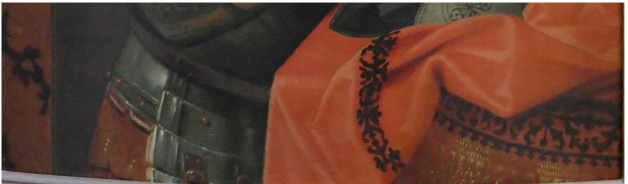
Figure 21a. Workshop of Bronzino, Portrait of Cosimo I de' Medici in Armor (Detail), c. 1545. Oil on panel. Metropolitan Museum of Art, New York.