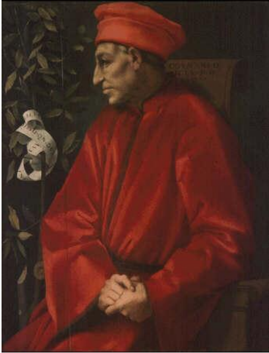
Figure 10. Pontormo, Portrait of Cosimo de' Medici , c. 1519-1521. Oil on panel, 90 x 72 cm. Galleria degli Uffizi, Florence. Inv. 1890, no. 3574.