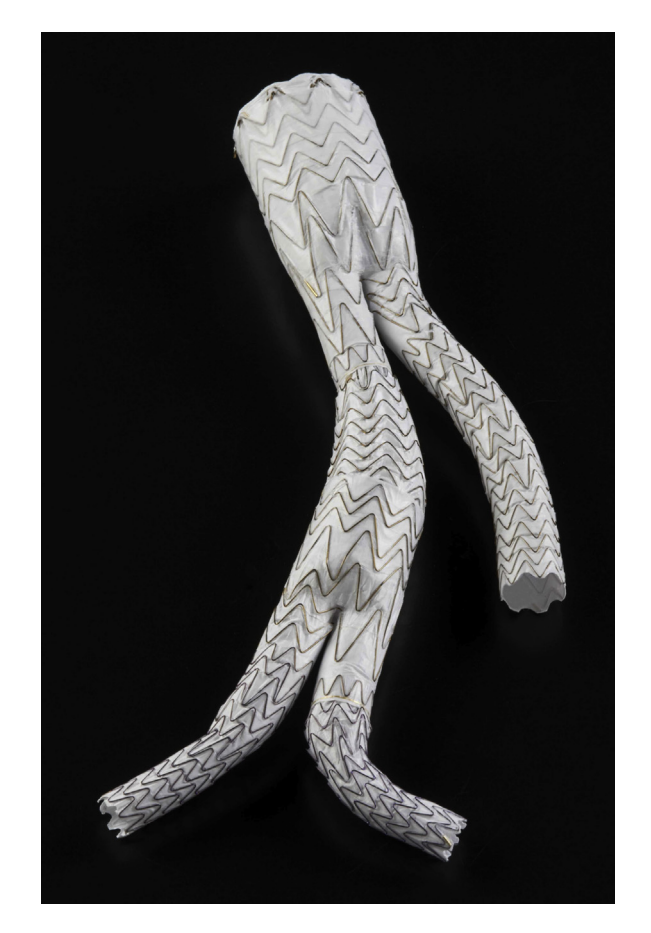
Fig 1. Image of the GORE EXCLUDER iliac branch endoprosthesis (IBE).

aortoiliac aneurysms, a standard Excluder device is placed via the contralateral site using a GORE EXCLUDER bridging stent with the IBE. A case example is presented in Fig 2. Another case example is presented in Fig 3 to illustrate the deployed IBE device with the crossover sheath in the body of the device. Follow-up was conducted according to the local protocols of the collaborating sites.