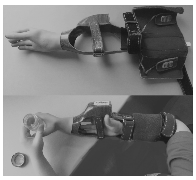
Figure 1 Prosthetic simulator.

(2) After that pilot study, it was decided that the assessor will time the tasks instead of the child as stated in the standard SHAP protocol because the children often forgot to start and stop the timer. Timing was started at the moment of opening the hand to grasp the object and stopped when the object was released. Furthermore, all of the objects (including the resized objects) and the changed SHAP protocol were tested in three other children (5 y/o), using the myoelectric simulator, to evaluate the feasibility of the SHAP-C protocol in pediatric prosthetic hands as well. (3) Based on the observations from the children using the prosthetic simulator, the starting position of a few objects was slightly changed to facilitate the gripping of the objects in prosthesis users (Table 1).