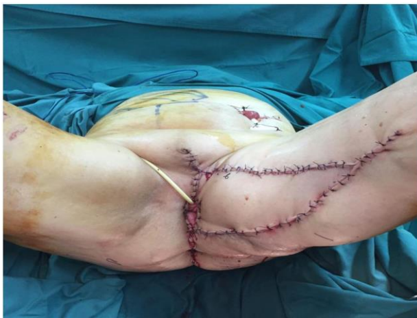
Figure 4. Coverage by a V-Y flap of the inner thigh

Frozen section examination pointed to free limits, but final histology exams showed involved margins. Due to the multiple recurrences of the disease and the involved margins, the patient was proposed for external beam therapy. But radiotherapy was rejected due to the extent of the target volumes. The multidisciplinary committee indicated a topical therapy with Imiquimod 5%. The patient underwent local therapy with imiquimod 5% twice a week for 6 months. At the time of this publication, the patient is 68 years old and she had no recurrence in the first 36 months after treatment.