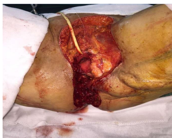
Figure 3. Large excision of the perineal areas, mons veneris and the flap.

We performed punch biopsies for each suspicious lesion, and the histological examination confirmed the VPD recurrence. She underwent a large excision and coverage by a V-Y flap of the inner thigh (Figures 3 and 4).