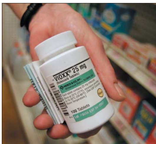
Merck withdrew Vioxx in 2004

The COX 2 hypothesis does, however, have an unexpected and dark side. Within the endovascular lumen, COX 1 and COX 2 have an important role in the interaction between platelets and endothelial cells and in thrombogenesis. 5 Activated platelets produce COX 1 dependent thromboxane A 2 . Thromboxane A 2