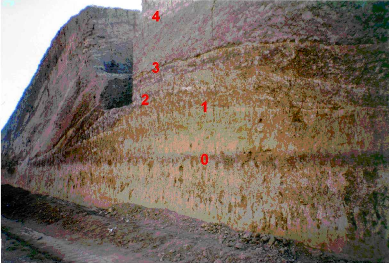
Figure 2a Photo of the large Ipatovo Kurgan, with paleosols 0–4 indicated