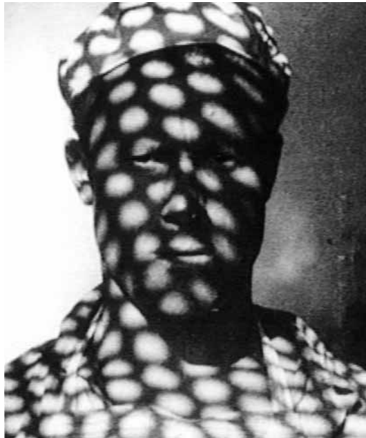
Still from Sergei Eisenstein's The Battleship Potemkin .

Cinematography got rid of my exclusiveness, simplified and probably modernized me. In my cinematography I see how form is created, how invention is created out of contradictions and mistakes, and how the consolidation of accidental change turns out to be newfound form. 101