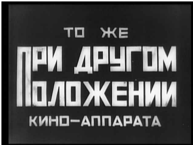
Fig. 2: Still from Dziga Vertov's film KINO-EYE (1924). Intertitle: "The same street viewed from a different camera set-up."