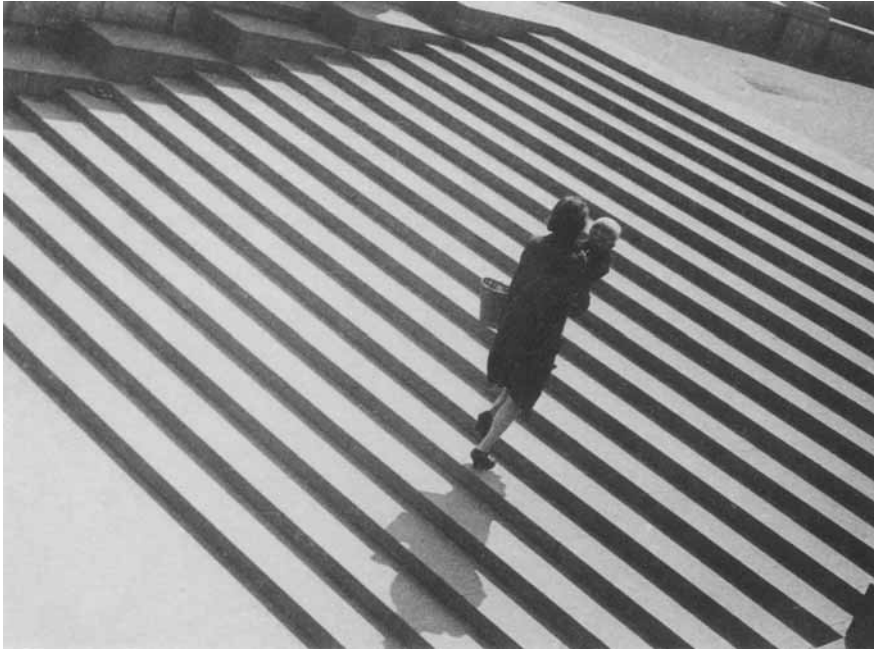
Alexander Rodchenko, "Steps" – photo, 1929.