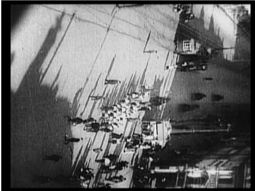
Fig. 3: Still from Dziga Vertov's film KINO-EYE (1924). The related street.