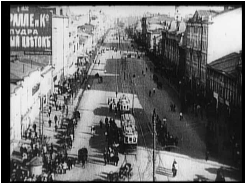
Fig. 1: Still from Dziga Vertov's film KINO-EYE (1924). Tverskaya street on a sunny day with passers-by.