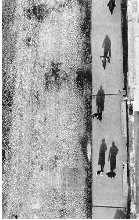
Fig. 5: Rodchenko, "Passers-by. A street" (1928).