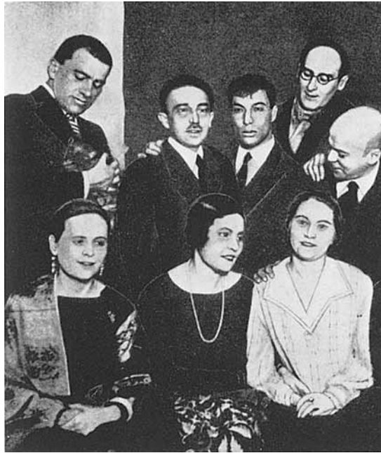
Group of Mayakovsky's friends, from left to right: V. Mayakovsky, O. Brik, B. Pasternak, S. Tretyakov, and V. Shklovsky; (sitting) E. Triolet, L. Brik, and R. Kushner.

rection of the Word, 59 in which he took exception partly to the [Symbolists'] concepts set forth by Potebnya and partly to those of Veselovsky [...] to advance the principle of perceptible form as the specific sign of artistic awareness [...] 60