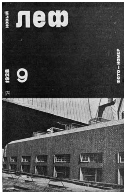
Fig. 4: Novyi Lef cover photo by Rodchenko.