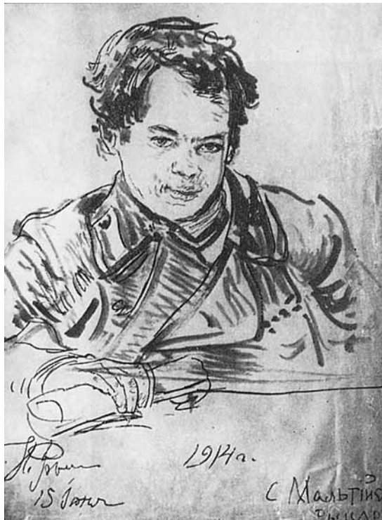
Viktor Shklovsky, c. 1913. Drawing by the famous Russian painter Repin.

modern experience: one of disorientation and disruption. One may even argue that perhaps, in the long run, they thus provided a new model to frame the utterly disorienting, disturbing, and even deeply traumatic experience of the Russian revolution and the grave crises following the revolution (hunger, starvation, loss, exile). One may argue that there is in fact a recursive principle at work here, where the new “cinema experience” (a shared experience) offered a new, modern model to frame the new, modern experience of poetry/art (as a disorienting and shared experience), which offered a model for the much larger and even traumatic experience of the revolution. But to follow this argument through would be an excursion far beyond the scope of this article.