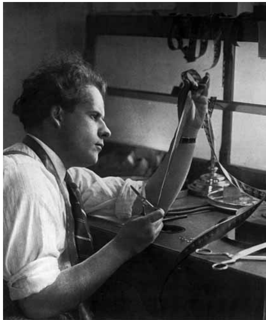
Sergei Eisenstein, six years younger than Shklovsky and Mayakovsky.

described by many as a true “event.” 43 In short, one can say that they experimented with new forms of addressing the viewer, listener, or reader to awaken the “static,” “stupid voyeur” of the traditional art forms (Marinetti). 44 An amount of emotional and psychological disorientation and shock effect – not unfamiliar to the early cinema spectator – and even an amount of face-to-face aggression might well have been part of this. Futurist poets sought the confrontation and were after creating instant and sudden effects, much the same as early cinema, to purposefully shock and thrill their audiences once the first accidental effects of the technical novelties started to wear off, as Tom Gunning argued. 45