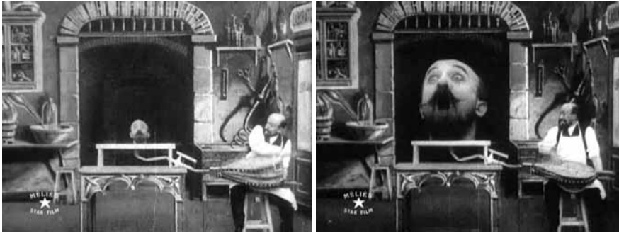
Film still 6 L'HOMME À LA TÊTE DE CAOUTCHOUC (Georges Méliès, 1901). Méliès used multiple exposure and “matte painting” (the term did not exist) in order to insert the tracking shot of his own head. Since the “compositing” (another modern word) is not perfectly locked, the head’s image is a little shaky, which now helps to see the so-called “inflating” (exocentric reading of the scene) as a move toward the head (egocentric reading of the scene).

At last, the possibility of being defamiliarized is linked to genetic knowledge , namely the spectator’s technical knowledge about filmmaking. Let us take the example of the magic distortion of bodies in fantasy films. Today, it seems difficult to believe that the contemporary spectators of Abel Gance’s LA FOLIE DU DOCTEUR TUBE (1916) would have read the optical distortions of the film as visual traces of distorted bodies, the special effects being so obvious (the camera is simply shooting distorting mirrors that can be found in any funfair; besides, the decor itself is distorted – not only the bodies in it). But another more recent example will help us better understand the process: the magic potion that the main characters of Jean-Marie Poiré’s LES VISITEURS (1993) drink is here again supposed to distort their bodies. Unlike Gance, Poiré did not simply film basic mirrors, but resorted to a state-of-the-art technology in 1993, namely warping. But warping is a software distorting 2D images, while we are now used to witnessing distortions of 3D images. As a result, a non-intentional type of defamiliarization occurs, as in LA FOLIE DU DOCTEUR TUBE : what we see is not the distortion of bodies, but of images. The same could be said about Chuck Russell’s THE MASK (1994).