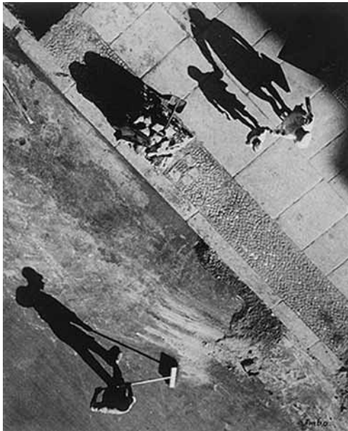
Fig. 6: "Mystery of the Street," 1928. Photo by Umbo (Otto Umbehr).