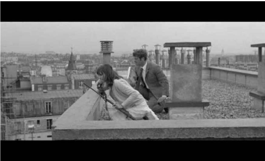
Stills from Jean-Luc Godard's PIERROT LE FOU , 1965.