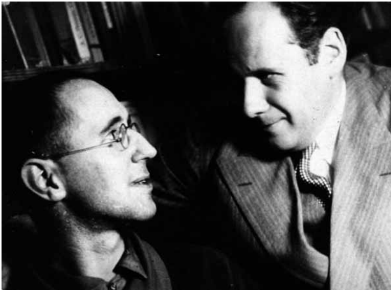
Brecht and Eisenstein, a photograph taken by Sergei Tretyakov in 1932.

The 1980s would see widespread and varied uses of Formalist approaches to the filmic text, as the writings of Shklovsky, Jakobson, Tynyanov and Eikhenbaum were assimilated. Much of this influence would be mediated through French theorists, notably Roland Barthes, Christian Metz and Gerard Genette, who had been among the first avid readers of the Formalists in translation during the 1960s. The many full-scale semiotic analyses of single films that appeared during the 1980s, and the studies of narration and its historical modes in Hollywood by David Bordwell and Kristin Thompson, can all be counted as descendents of the key Formalist insights of the 1910s and 1920s – insights which had to wait for a later historical conjuncture to achieve their wider impact and development. 53