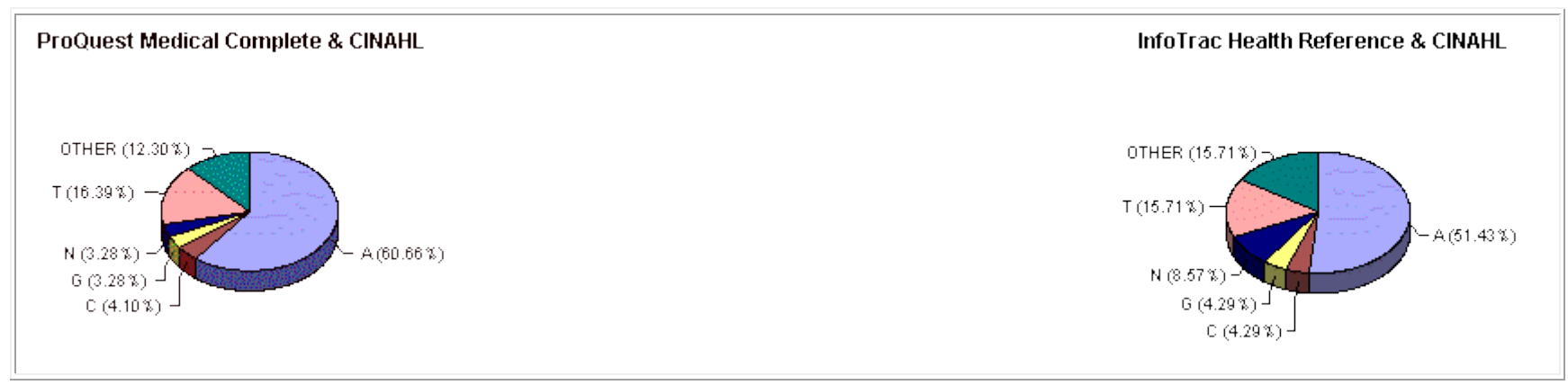
Table 2b Type of Material Duplicated

Key: Academic (A), Trade (T), Consumer (C), Government (G), Newsletter (N)