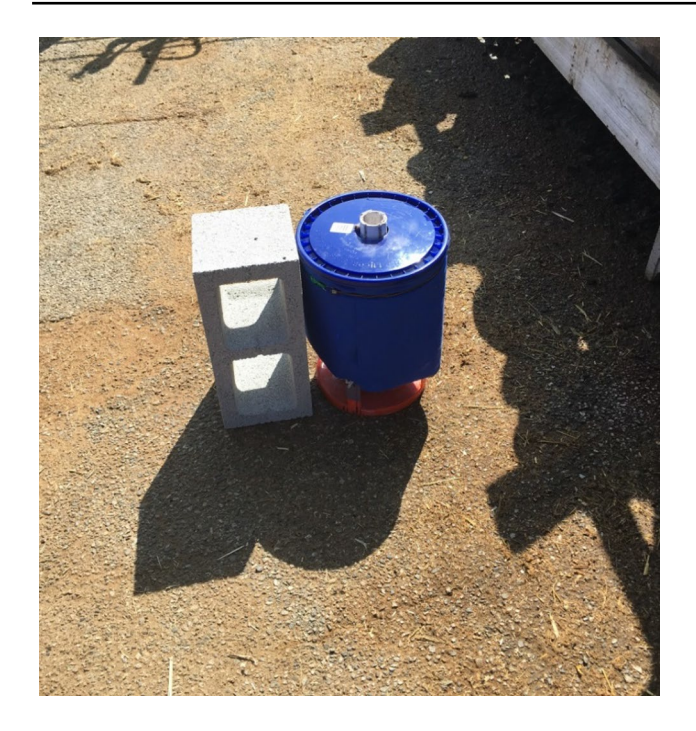
Fig. 1 Designs of pyriproxyfen (PPF) autodissemination stations for house flies tested on dairy farms in California. The devices were composed of inverted cones placed over pans of fly bait with the top of cone removed to allow flies to pass through a cylinder lined with PPF-treated fabric. The cone was shrouded with dark fabric and covered with a plastic lid to encourage flies that entered the cone to move upwards toward the light and through the treated tube

pre- and post-treatment pans of rearing medium/manure were placed on the farm in areas with visible fly activity.