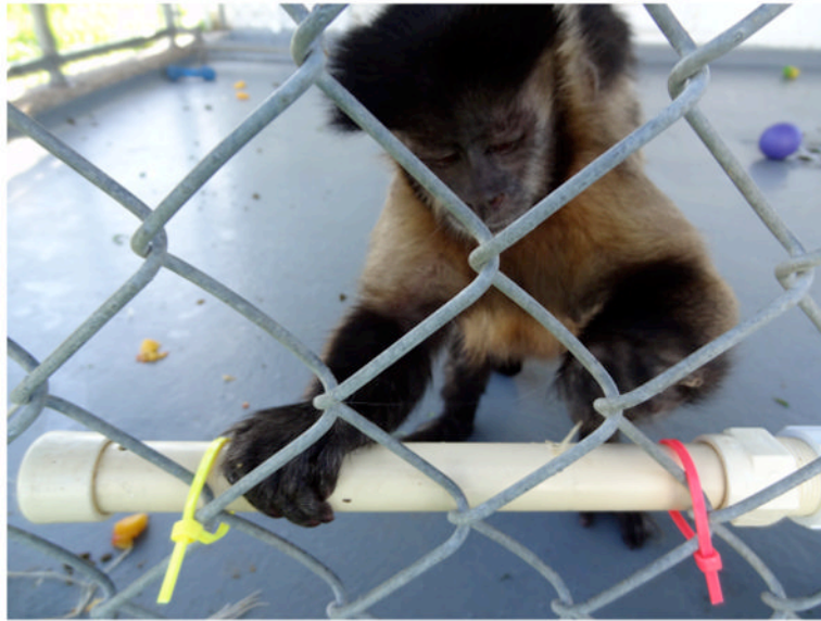
Figure 1. Photograph showing a capuchin monkey using her left hand while engaged in the tool use task.