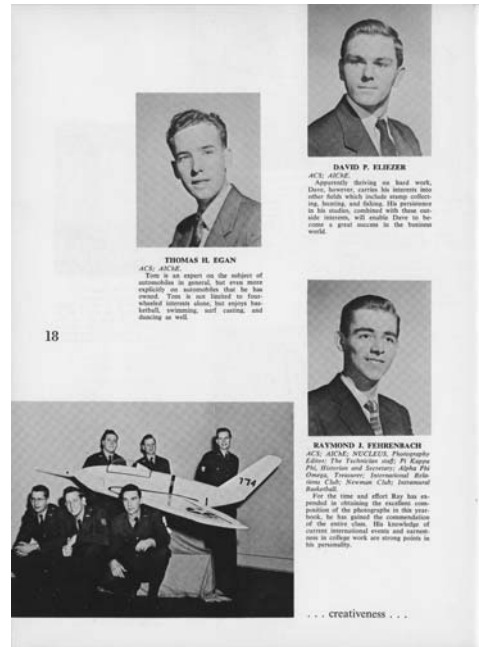
[ Students from 1955 yearbook ]

In the fall of 2005, the NJIT archives digitized the 1955 and 1980 yearbooks and placed it on the web in conjunction with the 50 th and 25 th anniversary of the alumni visit to the campus during reunion week. See the past yearbooks at www.library.njit.edu/archives