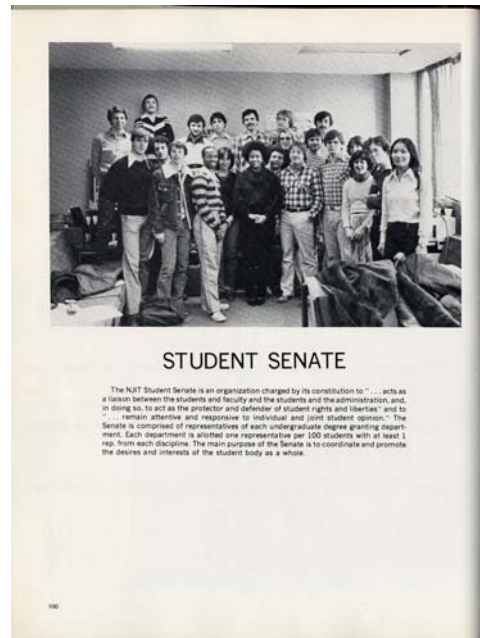
[ Student Senate from 1980 yearbook ]