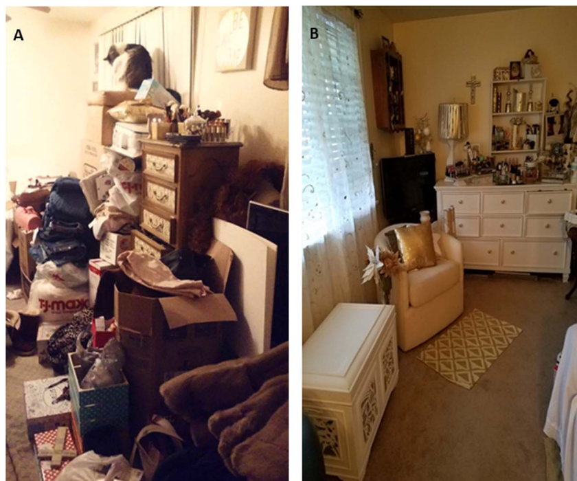
Figure 1. Patient’s home before use of KB220Z (left: A) and after 30 days on KB220Z (right: B). This patient admitted to a history of ADHD, opiate addiction, shopping addiction, and hoarding addiction. Traditionally, such diagnoses and behavioral addictions have been treated with pharmacotherapy (ADHD) and, more recently, with nutraceutical formulas, such as KB200z. There are, to date, no reports of the alleviation of shopping and hoarding addictions with any known pharmaceutical to our knowledge