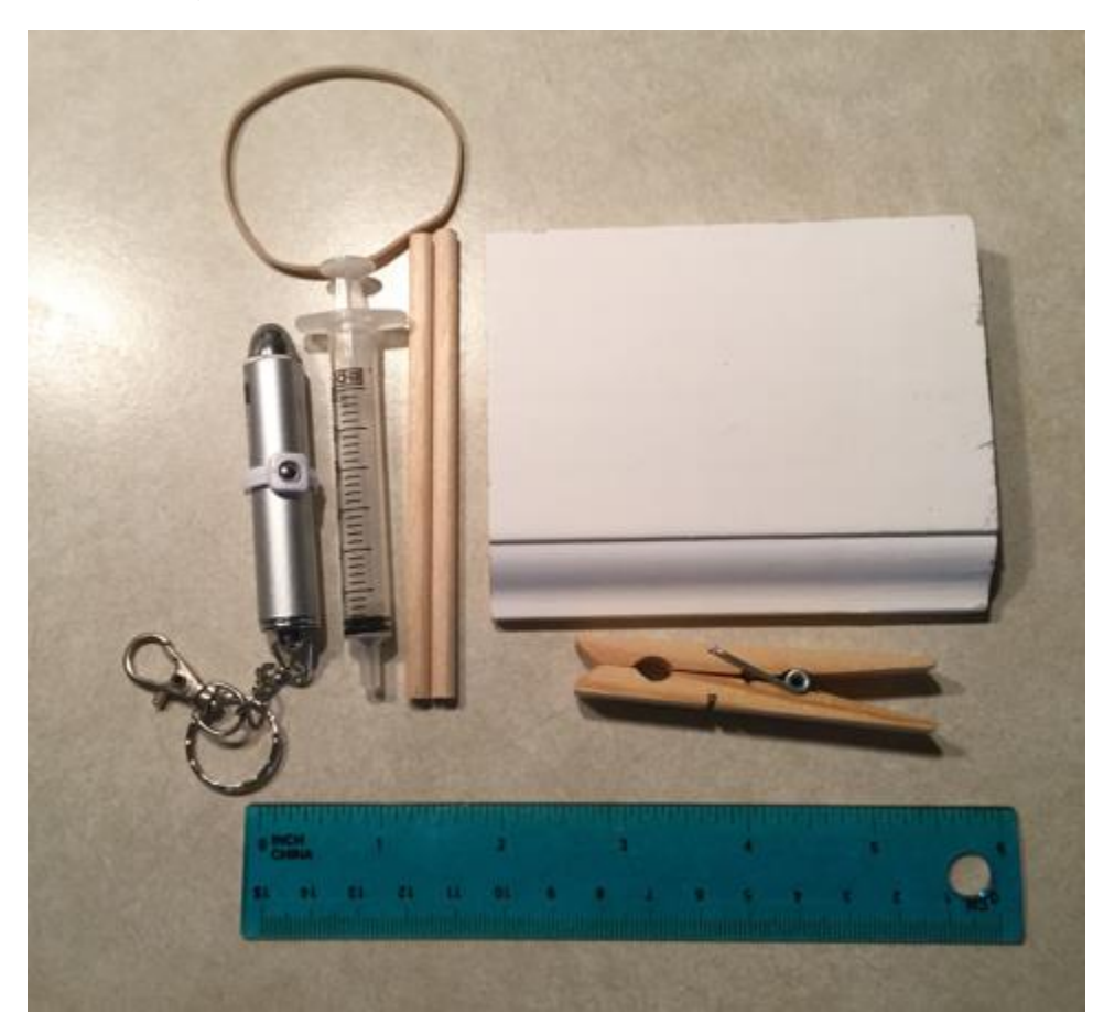
Figure 1 Parts for Liquid Drop Microscope with a 6" ruler for scale.

Caution: This project uses a laser. Laser light can damage the retina of an eye so be careful that the beam is not directed or reflected into an eye. For safety reasons, a low power laser (Class IIIa, under 5 mW or lower) is recommend.