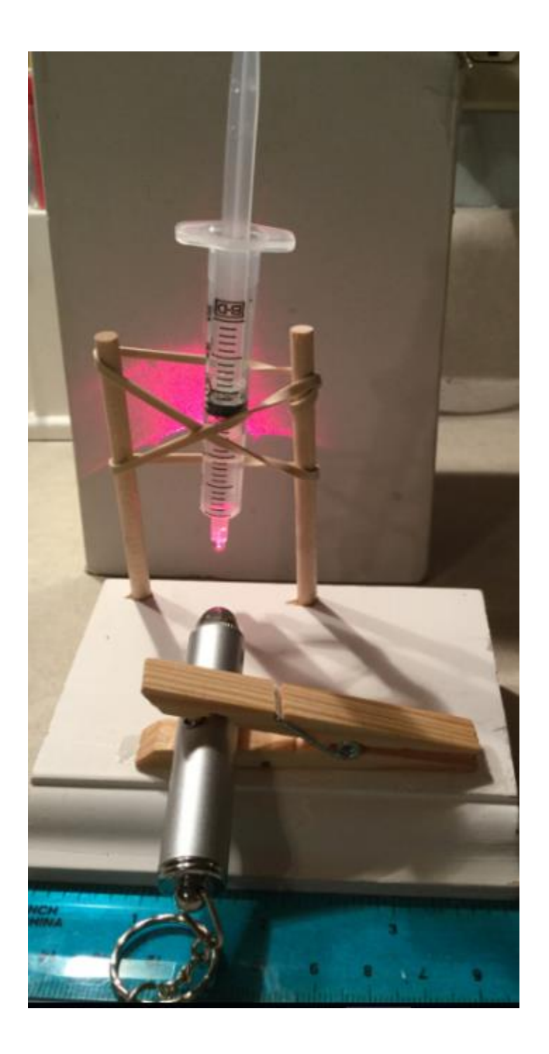
Figure 2 Assembled microscope