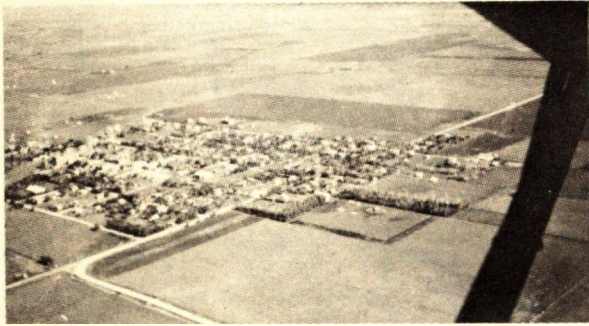
AIR VIEW OF WILMOT