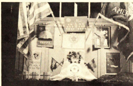
POPPY WINDOW DISPLAY