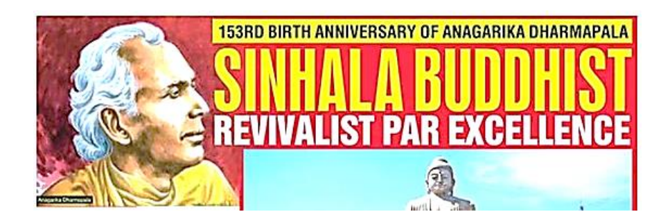
Figure 2. A graphic appearing in an English language National newspaper celebrating the birth anniversary of Anagarika Dharmapala "Sinhala Buddhist.... par excellence". 16

According to the 2011 Census of Sri Lanka approximately 70 per cent of the 20.35 million Sri Lankans are Buddhist, 12.6 per cent Hindu, 9.7 per cent Muslim (mainly Sunnis) 6.2 per cent are Roman Catholic, and 1.4 percent are other Christians. An important feature of the conflict in Sri Lanka is the modern fusion of ethnicity, language and religion to create composite communal identities. It is these composite communal identities that are in modern times at odds with each other. Buddhism is usually practiced by Sinhalese; Hinduism by Tamils and Sinhalese; Christianity by Sinhalese, Tamil, and Burghers; and Islam by Moors and Malays. As a result, Sinhala identity is popularly linked with Buddhist