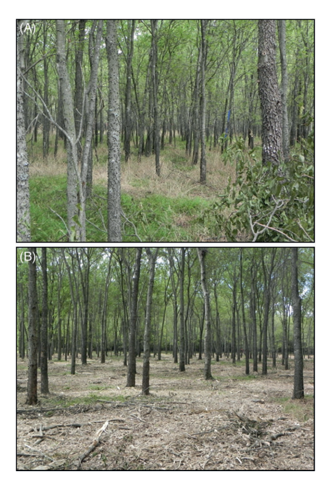
Figure 2. Examples of (A) an unmulched area with no mulching treatment and (B) an area that was mulched to reduce basal area.

reduce transpiration rates and increase vigor based on results from a study performed at the RCWMA in 2011 (Matt Symmank, Texas Parks and Wildlife, unpublished data). In May 2014, seedlings to be monitored in our study were selected at random. At the same time, heights of all monitored seedlings were measured to the nearest centimeter and basal diameters were measured to the nearest millimeter.