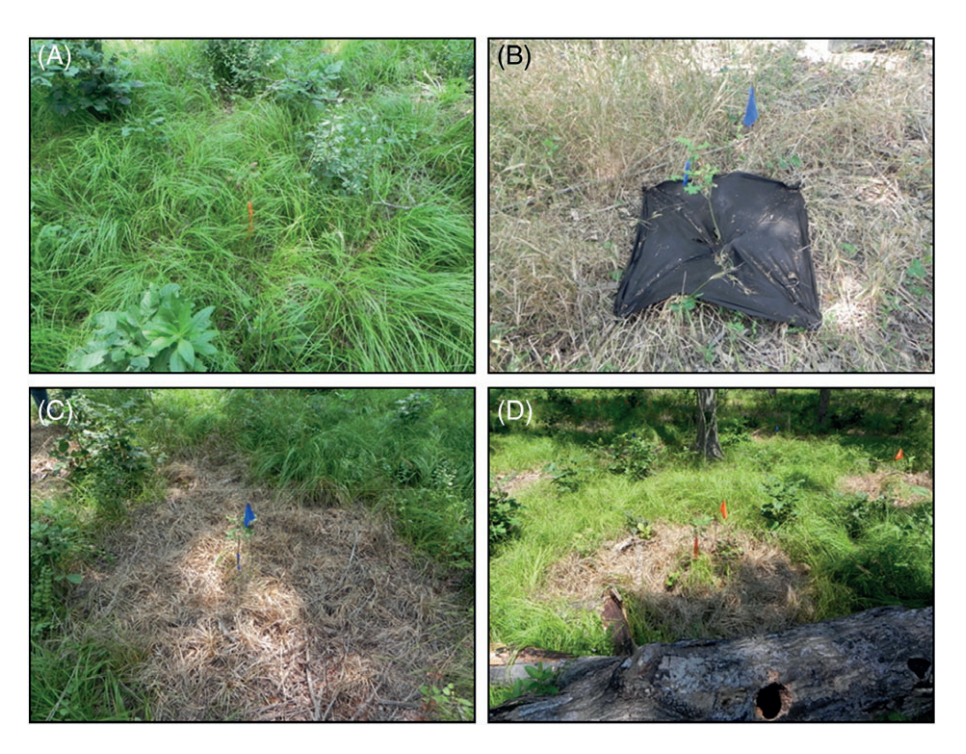
Figure 3. Typical examples of herbaceous competition and weed control effects in (A) an untreated experimental control, (B) a weed barrier mat treatment, (C) herbaceous weed control on a bur oak seedling, and (D) herbaceous weed control on a pecan seedling. Although the seedlings are difficult to see, in each photo they are marked by the colored pin flag or flagging.

apply herbaceous weed control following leaf-out of the competing herbaceous vegetation. Although it was our initial plan to use a pre-emergent herbicide such as sulfometuron, early growing season flooding also prevented this more typical herbaceous weed control treatment. Rodeo<sup>®</sup> (53.8% glyphosate) was the herbicide used to control herbaceous competition. A hand-held sprayer containing 15.6 mL/L water of Rodeo® and 15.6 mL/L water of Red River 90<sup>TM</sup>, a nonionic low foam wetter/spreader adjuvant, was used. The planted seedlings had already leafed out and had to be protected from the herbicide spray. A container with a 45.7-cm diameter circular opening was used to cover the seedlings. The mix was sprayed around the container approximately 0.5 m from the outside edge of the container. This range was selected to provide complete weed control up to the seedling while minimizing the potential for drift of the herbicide onto the seedlings. A range of 50-130 mL of the mix was sprayed around each seedling, depending on the level of herbaceous competition. Beginning during the second week of June 2014, and into the first week of July 2014, 1 \times 1 m Dewitt<sup>®</sup> 6-year, nonwoven, polypropylene hydrophilic treated fabric weed barrier mats were installed around seedlings receiving the weed barrier mat treatment.