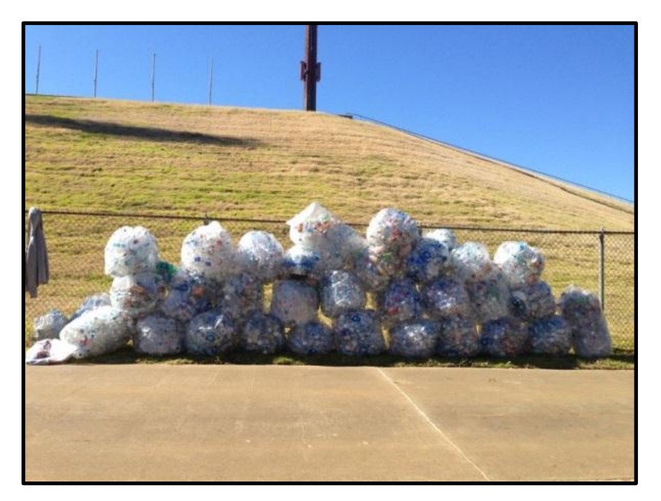
Figure 2. All the plastic bottles collected by T.E.A.M. at SFASU for the fall 2015 semester

Table 7. The weight in grams for an eight, sixteen, and twenty ounce type one plastic bottle collected by weighing one of the plastic bottles collected by T.E.A.M. at SFASU for fall 2015