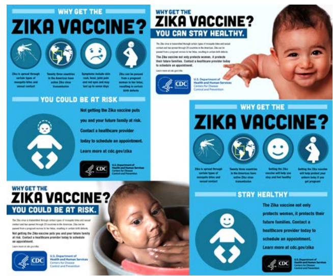
Figure 1. Loss-framed infographic (top left), loss-framed photo (bottom left), gain-framed photo (top right), and gain-framed infographic (bottom right).

HBM and TPB constructs were assessed using scales adapted from Myers and Goodwin. 33 All measures showed good reliability