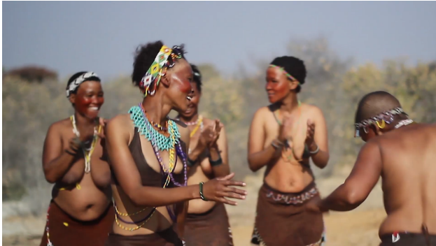
Figure 3: The women of the San community performing for the video production

We recorded community members dressed up in traditional clothes and engaged in a typical dance (Figure 3). The community members no longer wear those clothes on a daily basis but keep them for occasional tourist performances, to make a living.