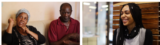
Figure 6: Participants of the video-elicitation.

Clips were shown to 29 people, and 64 reactions were recorded (Figure 6). In each session a participant watched between one and five clips in private and public spaces, such as at a shopping mall.