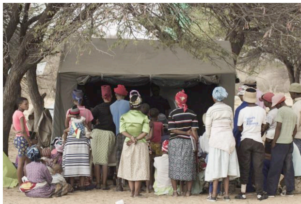
Figure 7: Community viewing video clips and reactions

Upon the next trip to Donkerbos, the community watched the clips and reactions while their reactions in turn were recorded to create multiple threads of digital conversations (Figure 7). Positive and negative urban reactions allowed the Donkerbos community to reflect upon their media representation and perception by the people out there, which led to much discussion.