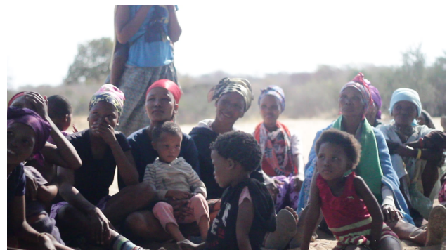
Figure 5: The Community discussing their traditions while viewing selected video clips for the elicitation.

The aim was to create a set of videos with varying content and underlying messages and provocations tapping into themes such as traditions, modernity, motivational, provoking, sad and political. The Video clips were short (approximately one minute long). Pilot testing reactions of different videos led to the final selection of videos used for elicitation. All videos were validated and approved by representatives of the San community (Figure 5).