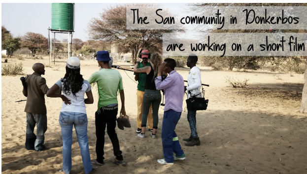
Figure 4: Scene of the Video clip: San as media producers.

This video showed how community members together with the media crew were producing a video for another project. The purpose of this video was to demonstrate that San people are very capable of being involved in modern technical tasks and embracing media for self-determination (Figure 4). We anticipated reactions referring to the prejudice, that San are primitive and not teachable.