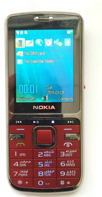
Figure 1: Typical Counterfeit Nokia Phone purchased by the first author in Kenya.

Because maintaining a charged battery was difficult, farmers tended to keep their phones turned off to “preserve the charge.” Yet, implicit in the design of services that deliver farmers time-sensitive information via SMS are assumptions that their handsets are always on so they can immediately obtain a price, be reminded to weed their crops or receive immediate updates about impending thunderstorms. We discovered that it is more likely for farmers to keep their handsets turned off, in order to save the battery charge. It was also common for farmers to not always have their phones in their immediate possession. When we asked to see farmers’ phones during our interviews, many told us they had left their