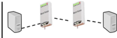
Figure 4 Scenario 3 (3 Hop) , the Unix boxes were separated by approximately 40 meters, the MP by 38 meters, one meter between Unix box and closest MP.