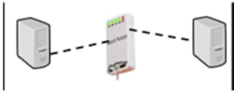
Figure 3 Scenario 2 (2Hop), one meter distance between the left Unix box and the MP. 15 Meters between the MP and the Unix boxes.