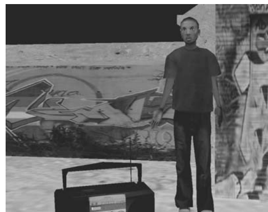
Figure 2: This hip-hop scene (in which the actor performs a rap and monologue about the San) precedes the historical San environment.

As the user walks toward the actor, he stops rapping and speaks to the user; he tells them about the San and their storytelling tradition. This monologue, along with the earlier rap, serves as preparation for the content which the users will encounter in the historical San VE. He then directs the user to the door, which opens to reveal the historical San VE. The user is then able to enter the San VE described above. Thus both VE's contain content on the San, this links the introductory and San VE's thematically.