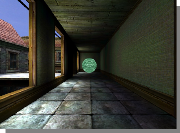
Figure 2 : Screenshot of pickup visible at the start of the walkthrough task

In our particular implementation of this technique, the time that it took a test subject to complete a pickup was recorded. In other words, times were taken between the starting position and the first object that required picking up, thus recording the time taken to pick up the first object. The timer was then reset and the time taken to pick up the second object from the position of the first object was recorded, and so on.