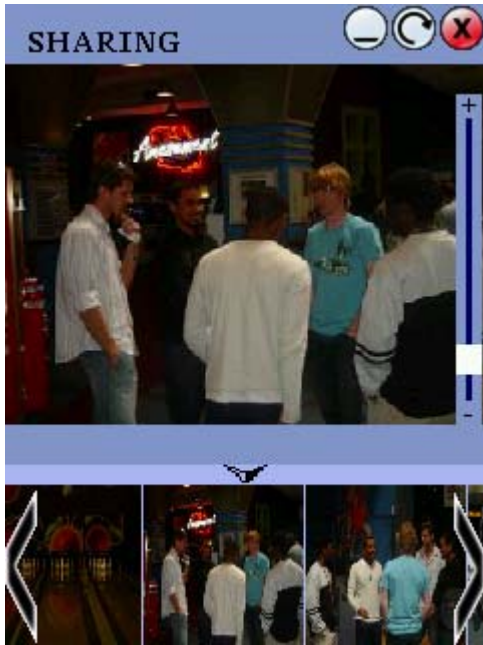
Figure 2: User viewing a shared photograph.