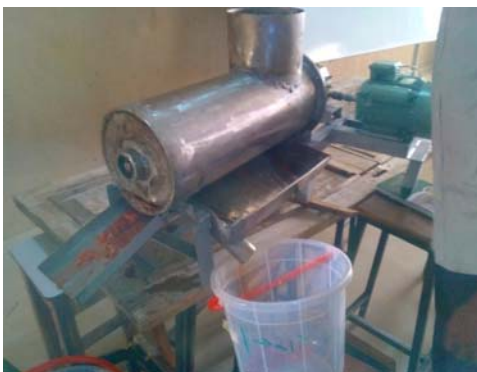
Figure 2 Watermelon juice extracting machine

This machine was designed on the principle of compression and squeezing (Figure 2). The first step is to wash the watermelon fruit before loading it into the hopper. The shaft powered by the gear train rotates anti-clock wise and the slicing blade will slice the watermelon and transfer it to the conveyor. The screw conveyor presses the watermelon fruits against the internal surface to extract the juice. Juice extracted is