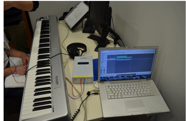
FIGURE 1 | Experimental setup.

Musicians were randomly assigned to one of six groups which determined stimulation order in their three sessions.