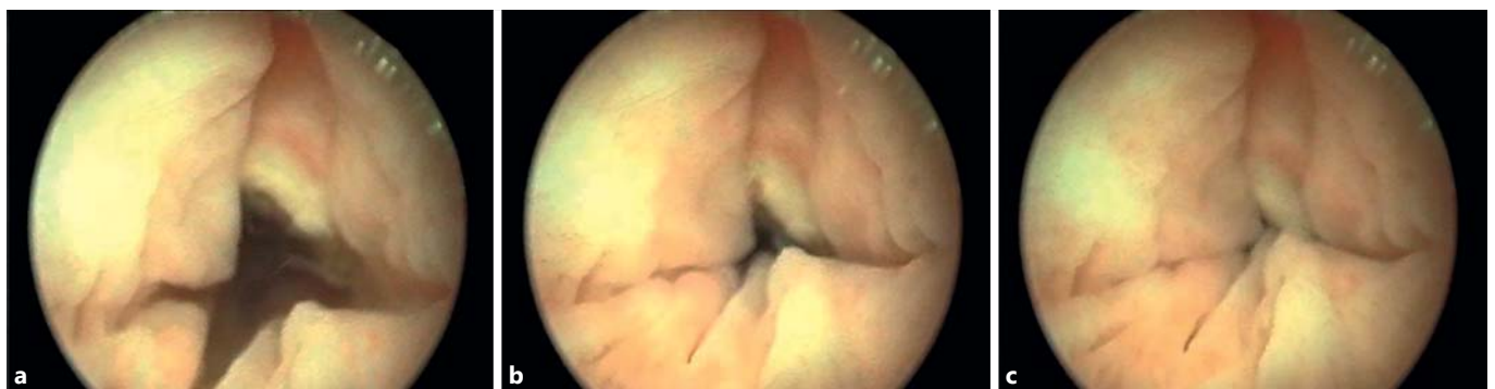
Fig. 2. Negative RT. a Before repositioning. b During repositioning without active sphincter contraction. c During repositioning with active sphincter contraction.