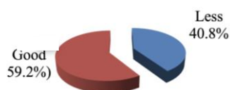
Figure 2: The Proportion of Smokers' Family Based on Hygiene and Sanitation at Berastagi Sub-District

Based on the above figure, it can be seen that there is 37.5% of the family of smokers with less healthy family security and 62.5% with good healthy family security. This healthy family security also has a closed relationship to sanitation and hygiene. Based on the research done, it was found that 71 families (59.2%) have good sanitation and hygiene and the remaining, 49 families (40.8%) has less sanitation and hygiene, as shown in Figure 2.