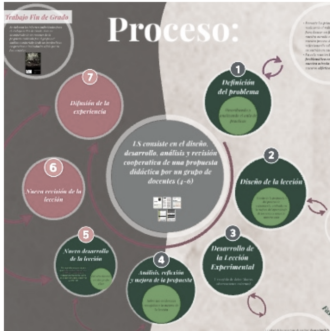
Figure 2. Prezi presentation used to explain the stages of LS and their relationship with the subjects

The content of the guide is explained in detail in the first seminar, and any doubts the students may have are resolved. Here we can see one of the slides of the presentation used, which explains the stages of the LS in relation to both subjects: