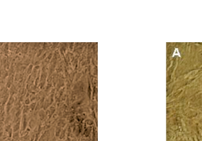
Fig. 4. Alizarin Red staining for the 20 day differentiation assay. (A-E) Matrix mineralization was evident in the form of calcium nodules (stained red) in the cultures under osteogenic conditions. (F) Control cultures presented no signs of mineralization. Magnification: A-D, F) 20X. E) 40X.