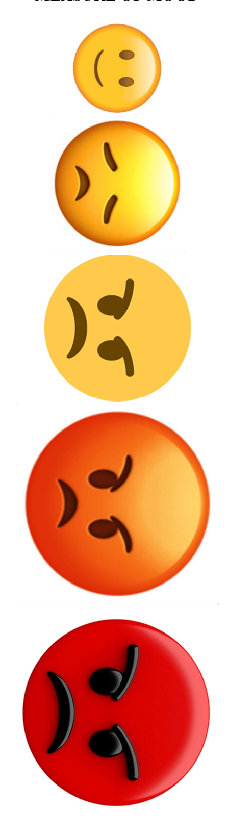
APPENDIX D MEASURE OF MOOD