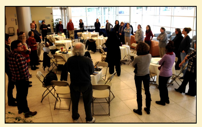
Faculty and staff at a "Teaching with Ferguson" and Beyond event in 2015

A series of working groups met between December and March to investigate current practices and realities and to formulate proposals. The working groups were organized around operational and academic areas, with the thought that recommendations might complement those to come forward through the program prioritization process. Operational working groups included trainings for faculty and staff, orientations for faculty & staff, hiring for diversity, alumni, and student leadership and training. Academic working groups included the first year experience and the core curriculum.