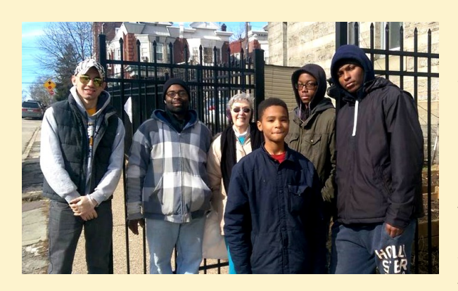
LGU Students at Our Lday of Hope

The Leadership and Global Understanding Capstone course places students in social ministries in northwest Philadelphia in order to work with leaders in those ministries and support our neighborhood. Faith-based communities are among the most important "assets" in Philadelphia and partnerships of these churches, mosques and organizations with universities can help us create stronger communities. One of those churches is Our Lady of Hope on Broad Street. We intend for this cooperative effort to be one of an ongoing partnership between La Salle and Our Lady of Hope, the closest Catholic church to the La Salle campus.